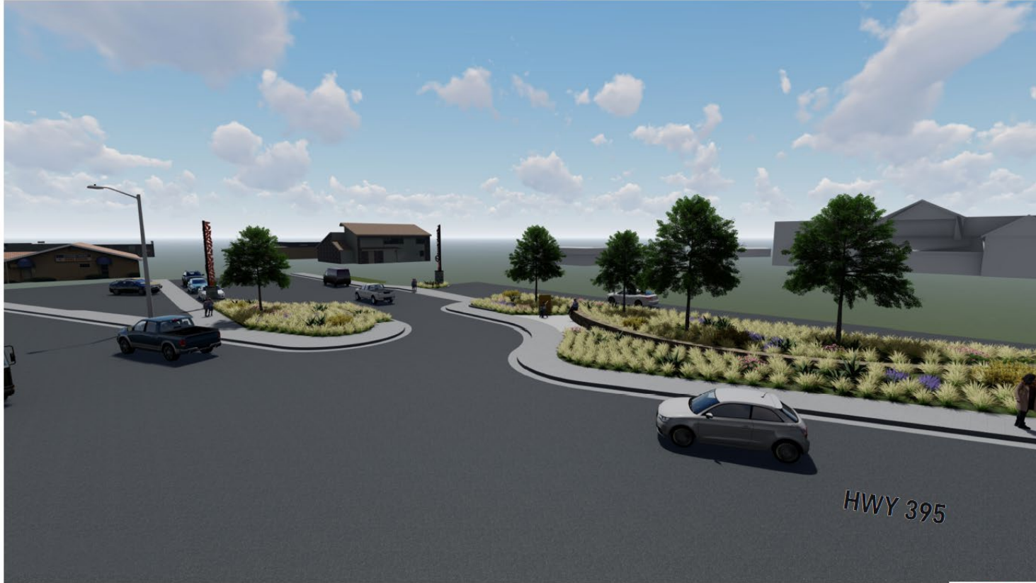
HERMISTON SE 2ND STREET IMPROVEMENTS | VIEW 2 MARCH 27, 2023