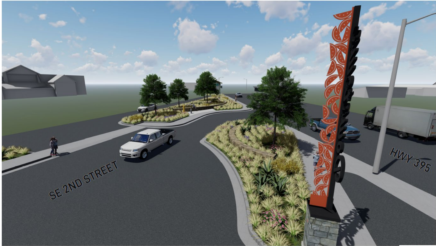
HERMISTON SE 2ND STREET IMPROVEMENTS | VIEW 1 MARCH 27, 2023