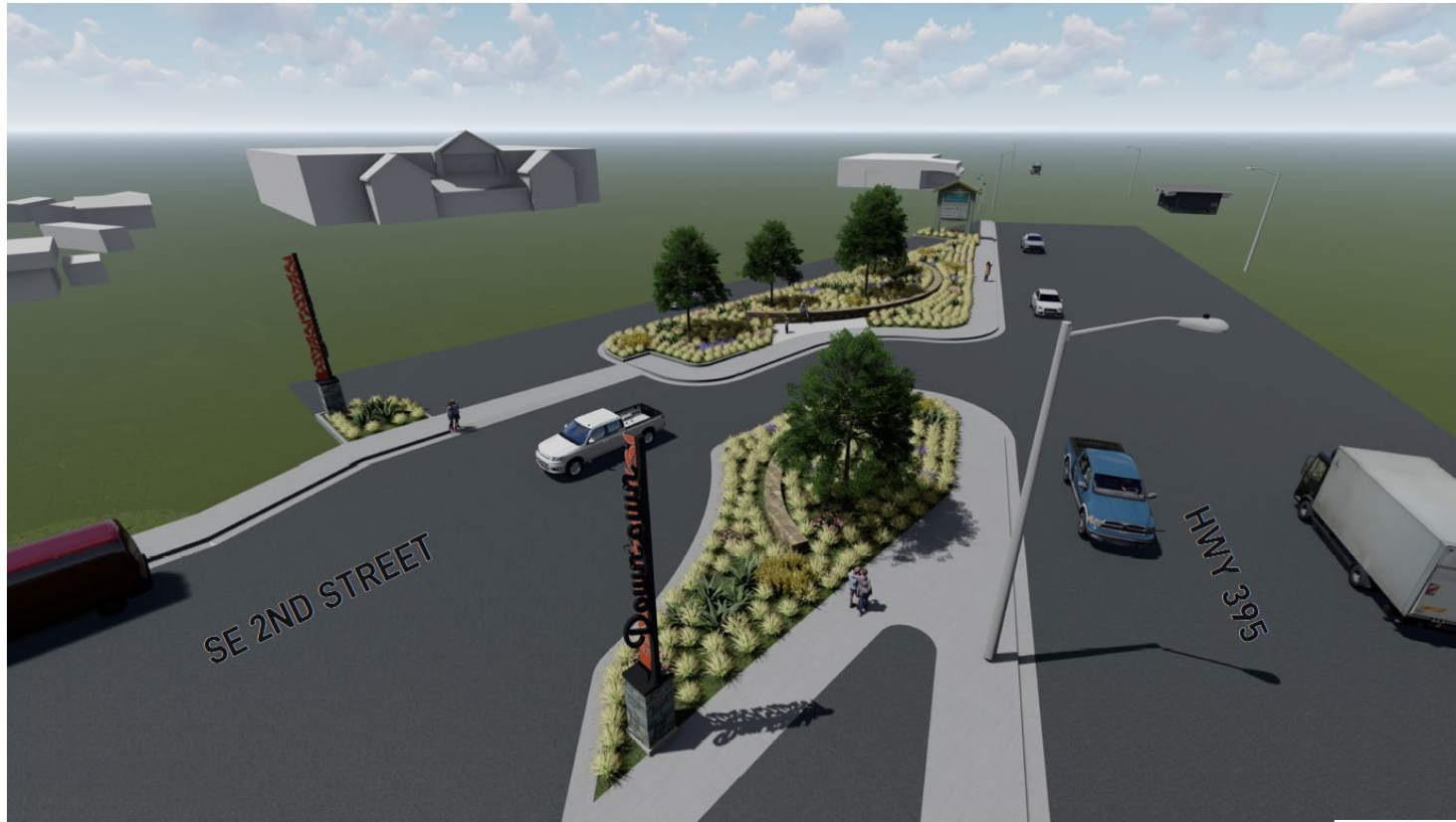
HERMISTON SE 2ND STREET IMPROVEMENTS | VIEW 5 MARCH 27, 2023