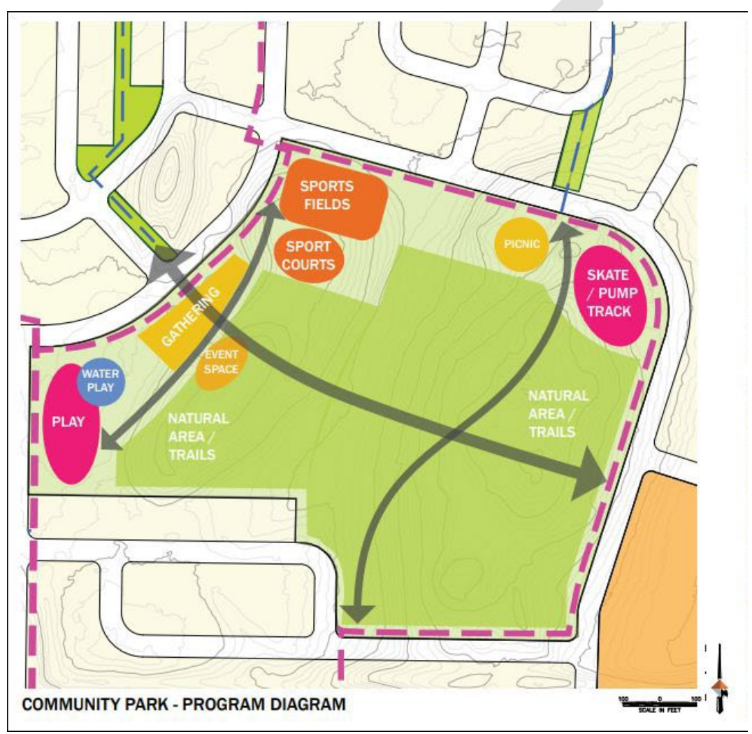
Figure 2 Community Park Conceptual Plan

Develop parks within the Area including but not limited to: (1) A large 38-acre community park with amenities designed to enhance the desirability of the entire area, and (2) several smaller neighborhood parks and trails throughout the Area with amenities designed to serve more local demands within the Area..