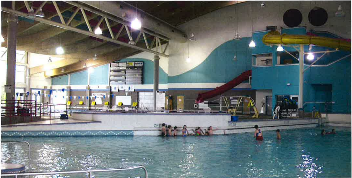
Clackamas Aquatic Center