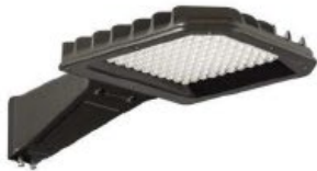
Scope of Work