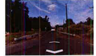
Northbound canal crossing