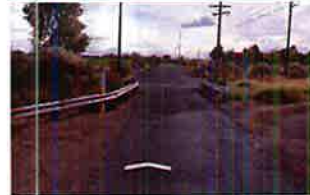
Southbound canal crossing