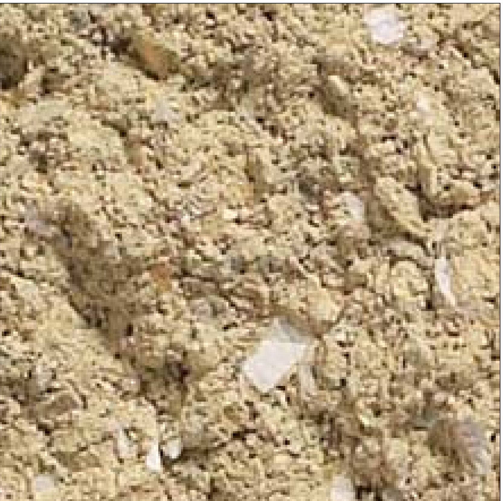
NORTHFIELD SPLIT FACE BLOCK - BALSA