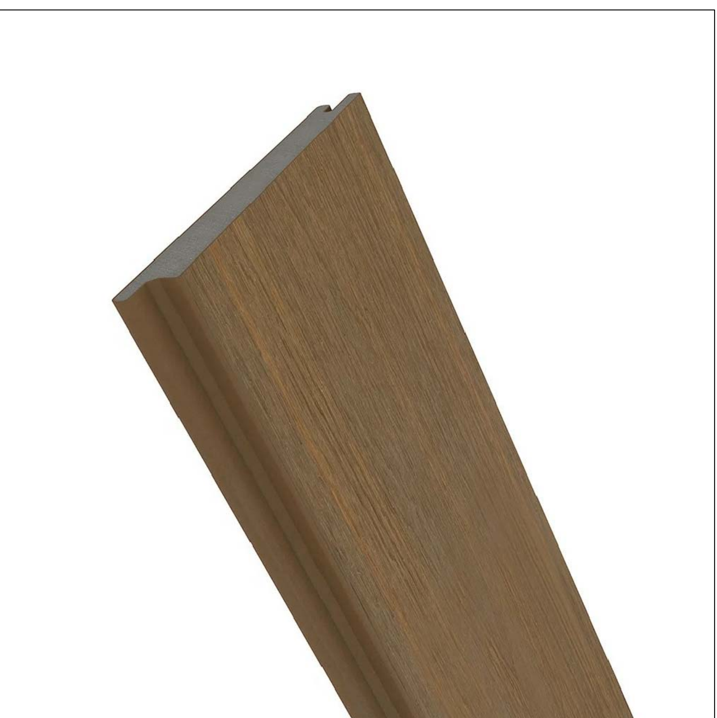
NEW TECH WOOD COMP. - PERUVIAN TEAK