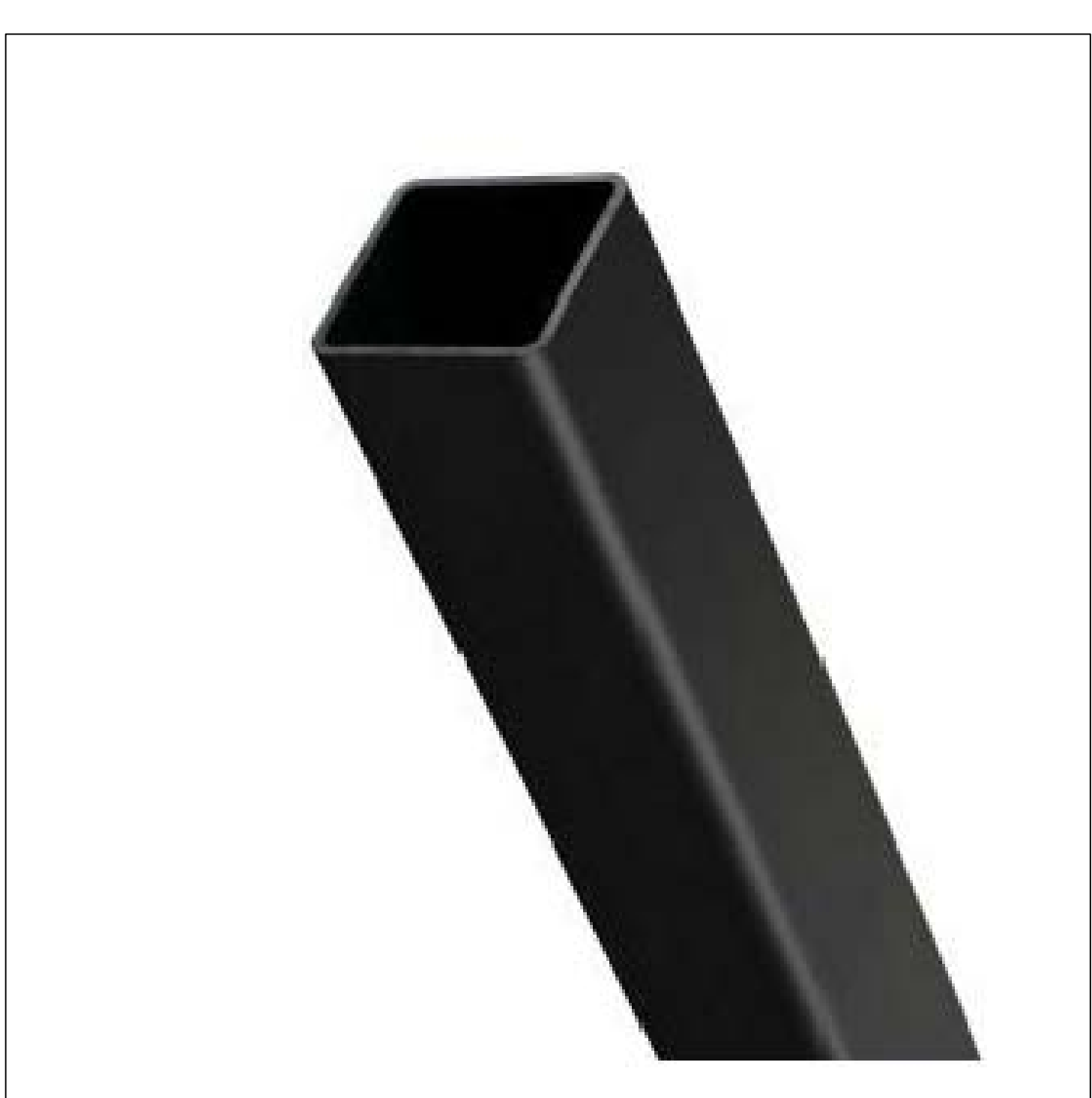
BLACK POWDER COATED SQUARE STEEL