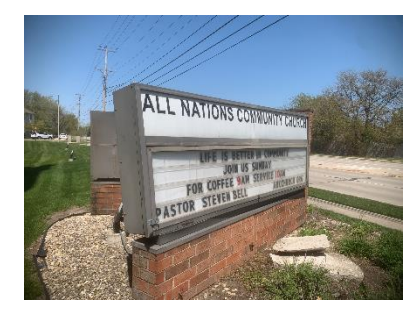
Figure A: Existing signage at All Nations Community Church. Note Vshaped monument sign and changeable letter signage.

The signage proposed by the applicant will replace existing monument signage located in the front yard setback of the church building. The sign consists of two monument signs angled approximately 60 degrees from the public right-of-way and placed in a V-pattern facing toward from the church (see Figure A). Each existing sign is a bulletin board sign with changeable letters and a backlit sign portion with sign copy identifying the name of the church. Recent photographs submitted by the applicant note that the sign is currently utilizing outdated technology and is currently below general standards of maintenance. The applicant has proposed to replace the monument signs with electronic bulletin board signs providing identification of the church and information about the church.