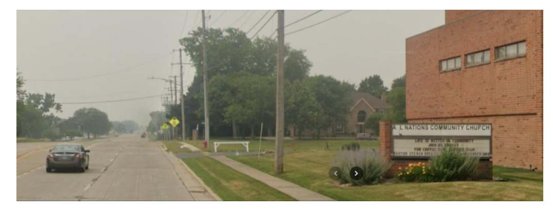
Figure D: View from Kedzie Avenue (looking north) demonstrating visibility of signage from neighboring residential properties on Mallard Drive.

Staff recommends numerous conditions which have been placed on other electronic bulletin board signs at civic and charitable institutions throughout the Village. These conditions are currently being recommended for inclusion as standardized form requirements for all electronic signs in most zoning districts. These conditions include: