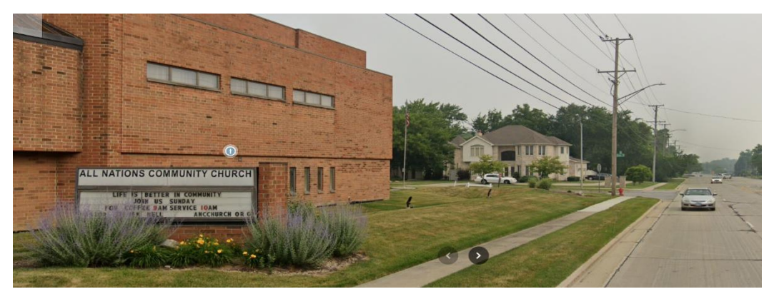
Figure C: View from Kedzie Avenue (looking south) demonstrating visibility of signage from neighboring residential properties on 186th Street.

On-site analysis reveals that the signs are visible from multiple residential properties nearby, including two homes at 3200-3208 186<sup>th</sup> Street, two homes along Kedzie Avenue (18559 and 18655 Kedzie), and two homes along Mallard Drive (3201-3205 Mallard Drive). Electronic bulletin board signage may have impacts on these properties, where the signage is visible from the front of the residential structures where screening is not present. Staff recommends that restrictions be placed on brightness, the rate of change for messaging on the sign, and the ability to disable the sign when damage or signage errors are present.