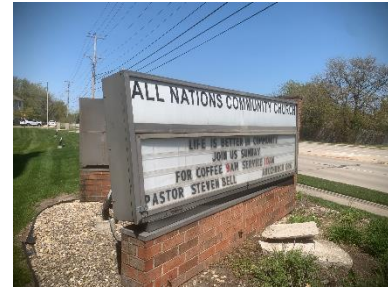
Figure A: Existing signage at All Nations Community Church. Note V-shaped monument sign and changeable letter signage.

The signage proposed by the applicant will replace existing monument signage located in the front yard setback of the church building. The sign consists of two monument signs angled approximately 60 degrees from the public right-of-way and placed in a V-pattern facing toward from the church (see Figure A). Each existing sign is a bulletin board sign with changeable letters and a backlit sign portion with sign copy identifying the name of the church. Recent photographs submitted by the applicant note that the sign is currently utilizing outdated technology and is currently below general standards of maintenance. The applicant has proposed to replace the monument signs with electronic bulletin board signs providing identification of the church and information about the church.