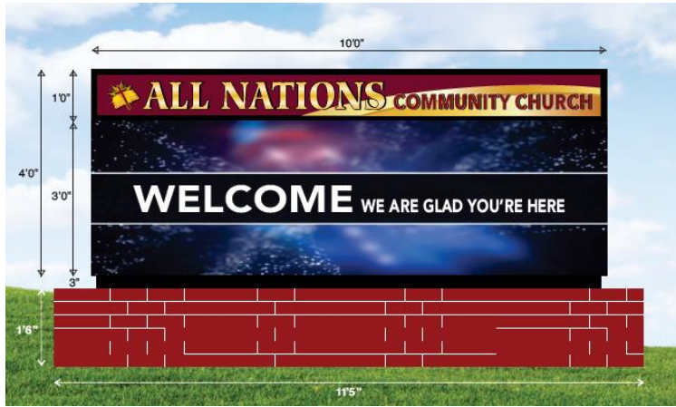
Figure B: Inset of design of proposed signage. Signage to be repeated twice to create V-pattern with monument signs at 60 degree angle.

Each of the two proposed monument signs includes an LED backlit cabinet sign measuring 12 inches by 10 feet across the top of the sign serving as an identification sign for the church. The remainder of the sign area on each sign (36.5 inches by 10 feet) is an electronic bulletin board with changeable copy and LED display. The sign will be attached to an existing 1' 6" brick sign base with steel base plates with metal panels. The existing brick monument sign base is approximately 18 inches longer than the new sign, measuring 11 feet and 5 inches in length. The dimensions of all signage proposed meets the form standards found in the Village Code of Ordinances. No details on landscaping are currently provided by the applicant, and staff has provided recommendations for the provision of landscape plans which show details about any proposed landscaping to accompany the sign proposal and ensure a suitable transition between the ground and the proposed signage.