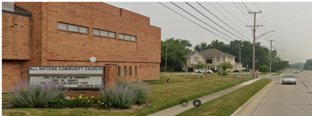
Figure C: View from Kedzie Avenue (looking south) demonstrating visibility of signage from neighboring residential properties on 186th Street.

On-site analysis reveals that the signs are visible from multiple residential properties nearby, including two homes at 3200-3208 186 th Street, two homes along Kedzie Avenue (18559 and 18655 Kedzie), and two homes along Mallard Drive (3201-3205 Mallard Drive). Electronic bulletin board signage may have impacts on these properties, where the signage is visible from the front of the residential structures where screening is not present. Staff recommends that restrictions be placed on brightness, the rate of change for messaging on the sign, and the ability to disable the sign when damage or signage errors are present.