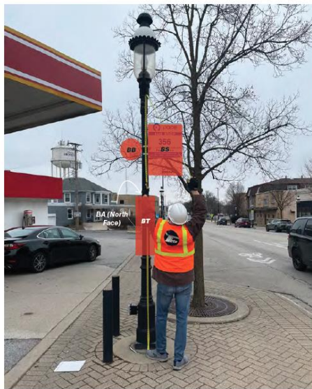
Interagency Signage Plan - Homewood