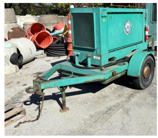
Old 1984 ONAN 30kw towable generator