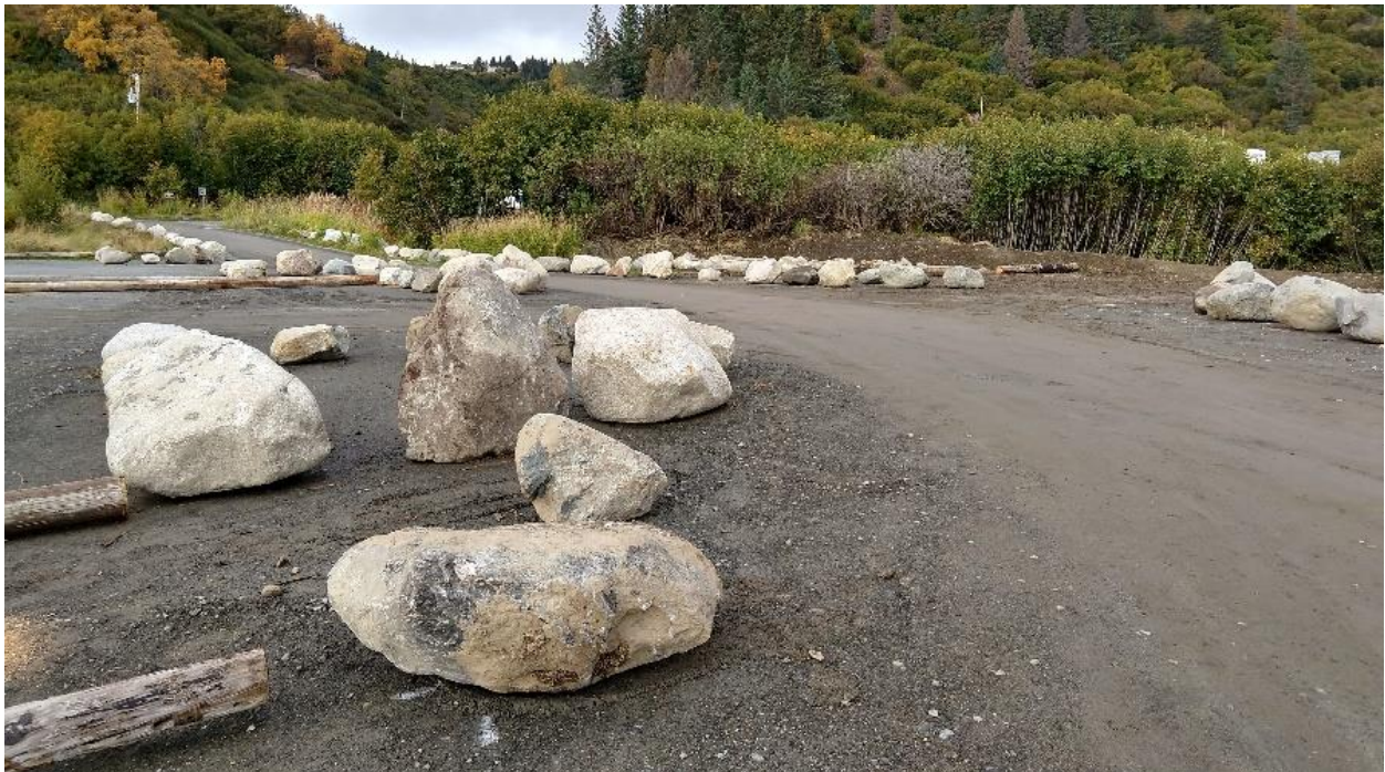
Looking north toward the campground