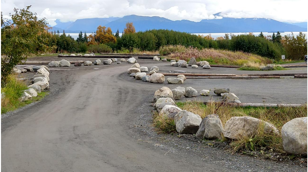
Looking south down the new access road realignment