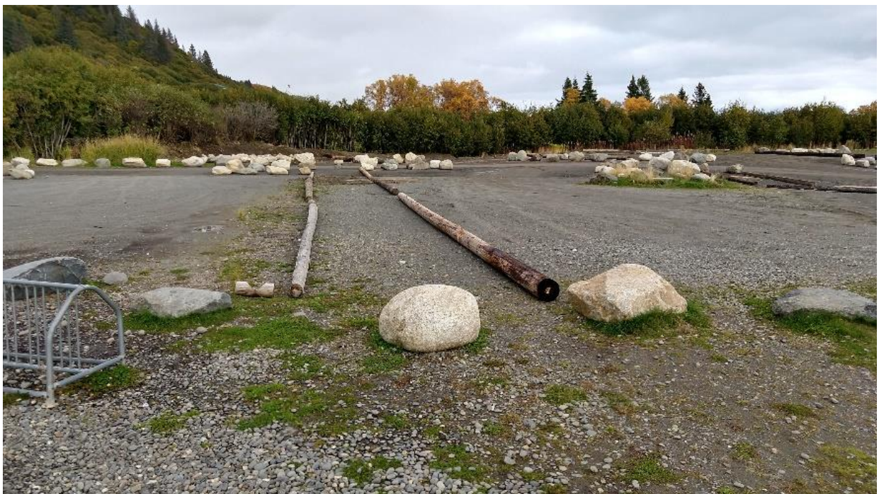
Typical protected pedestrian access corridor