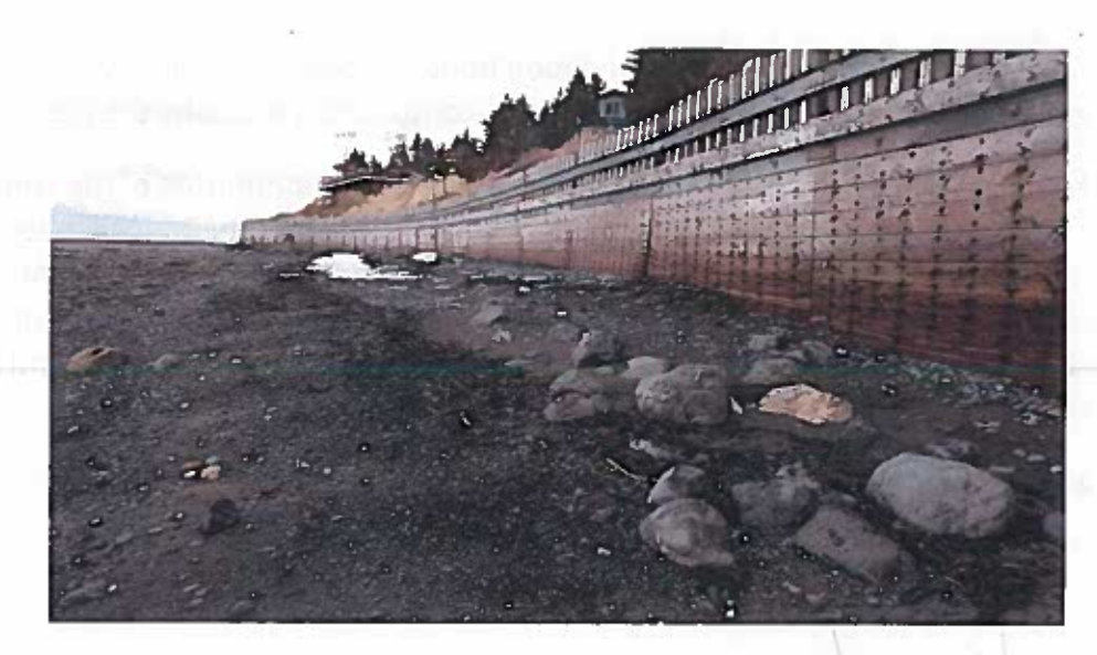
Figure 4 January 2019 Middle of Wall