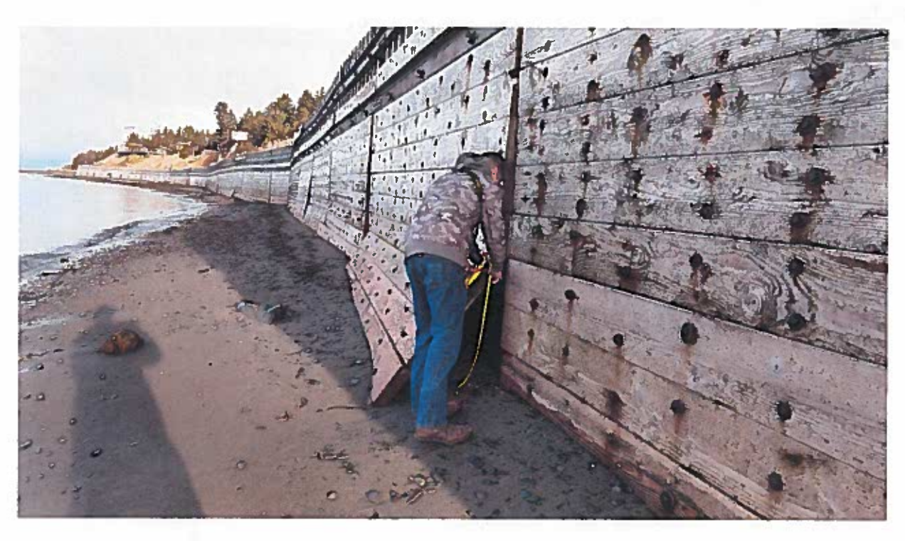
Figure 5- HDR, Inc. inspection of wall to assess damage in support of recommending potential long term improvements.

As of today, the remaining balance available for use totals $102,153 (please see chart attached to letter). If we see another year like 2017, the fund would be wiped out. Rather than wait for emergencies to arise, we took a proactive step this past year by contracting with HDR, Inc. to provide an engineer's analysis of the wall in its current state and different maintenance approaches we could take to best protect the Seawall. The two most affordable concepts proposed were Armor Stone Scour Protection and Geotextile Container Scour Protection with preference given to armor stone. The current mil rate set for the ODLSA and the $10,000 contribution from the City is not enough however to cover project costs. In an effort to assist the ODLSA in making a major maintenance project of this size possible, the City may have the option to work with the Alaska