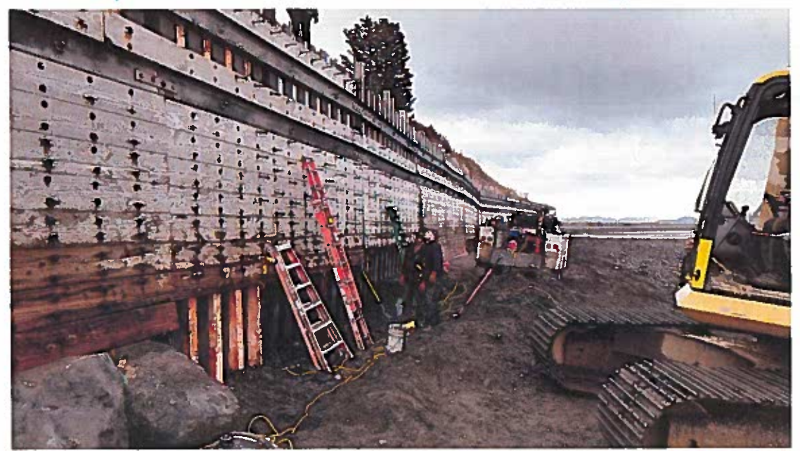
Figure 1 - January 2019, replacing vertical posts to allow installation of new horizontal timbers.