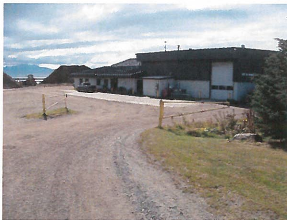
Existing Public Works building

Based on an evaluation of current and future needs (see table), it is expected that a new site containing all Public Works maintenance facilities would require 4.6 acres. Ideally, this site would be located outside the tsunami inundation zone; within or close to the Central Business District; and compatible with adjacent land uses. The existing Public Works site could be converted into public summer use open