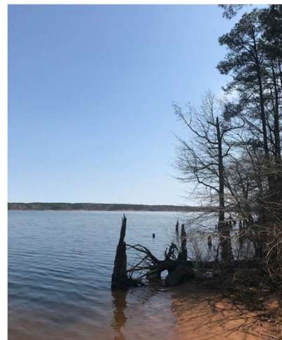
Falls Lake Reservoir