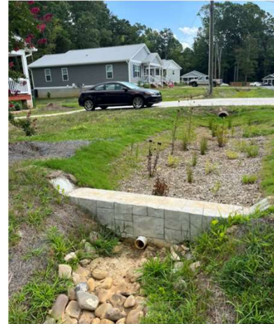
The Award-Winning Odie Street Stormwater Green Infrastructure Project