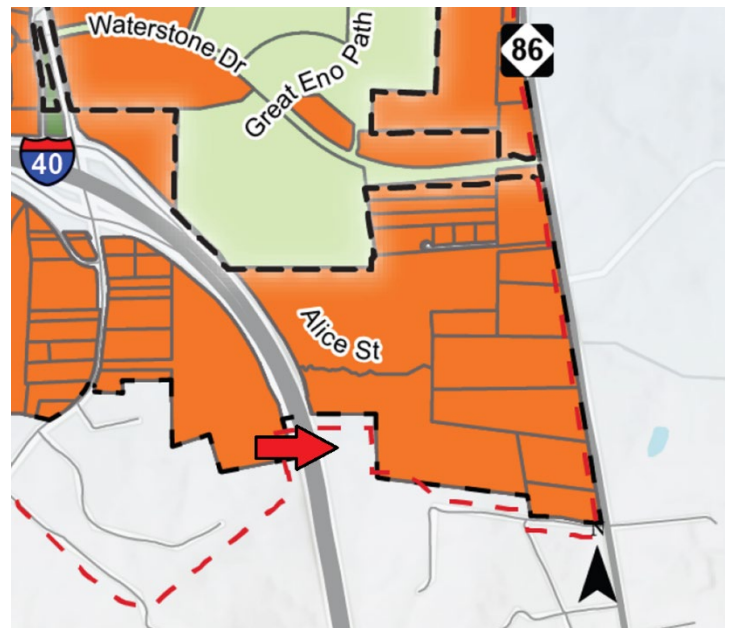
Excerpt from Figure 4.4 in the CSP

Note that the Board of Commissioners can determine that a zoning amendment is inconsistent (in full or in part) with its comprehensive plan and still approve the amendment. NC GS § 160D-605 (a), Governing board statement – Plan Consistency states, "if a zoning map amendment is adopted and the action was deemed inconsistent with the adopted plan, the zoning amendment has the effect of also amending any future land-use map in the approved plan, and no additional request or application for a plan amendment is required."