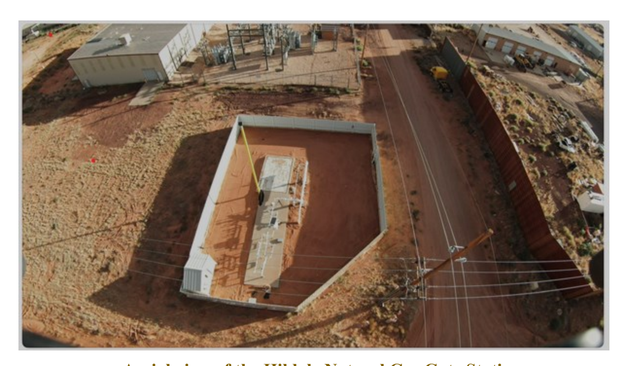
Aerial view of the Hildale Natural Gas Gate Station

Gas staff delivered and hooked up four (4) new propane tanks for customers. Staff installed 162 feet of two (2) inch gas main line on north Oak Street and Arizona Avenue which will serve two (2) new customers. Staff completed a gas leak survey which is a comprehensive inspection of the gas distribution system where technicians analyze sites for symptoms associated with gas leaks. Surveys are conducted annually to ensure that the system comply with guidelines and regulations. Mitch Jessop conducted an annual Emergency Gas Response training with the Hildale City office staff and the Utility team. We received a letter of acceptance for our annual audit from Arizona Pipeline Safety Commission.