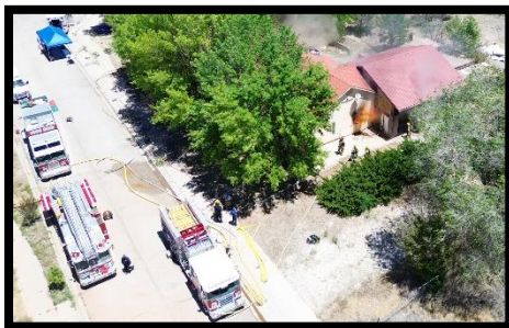
6/1/24 – Live-Fire Training at acquired structure in Centennial Park.