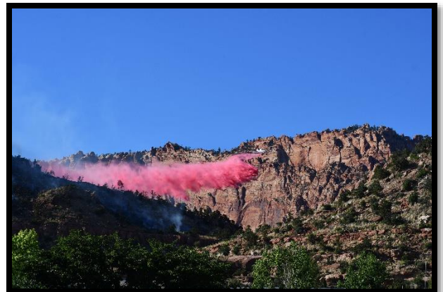
7/15/23 – 7.3 acre “Saddle” wildland fire near the granaries. BLM and air resources part of the response.