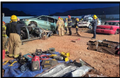
9/12/23 – Extrication training.