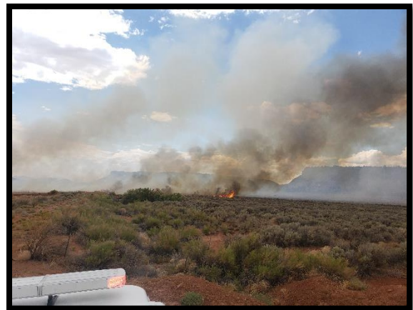
7/12/22 – 150 acre brush fire in Apple Valley. Caused by lightning strike.