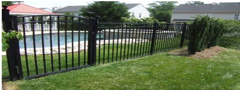
Wrought Iron Fence