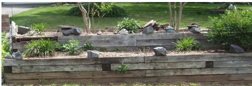
Wood Retaining Wall