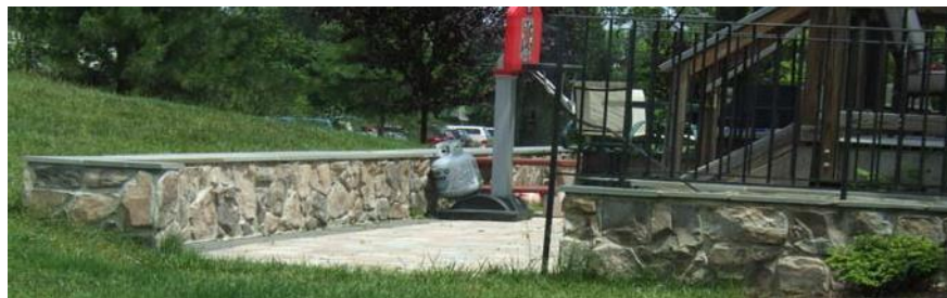
Stone Retaining Wall