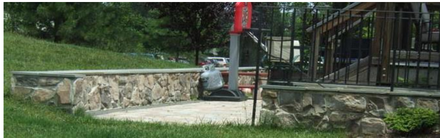
Stone Retaining Wall