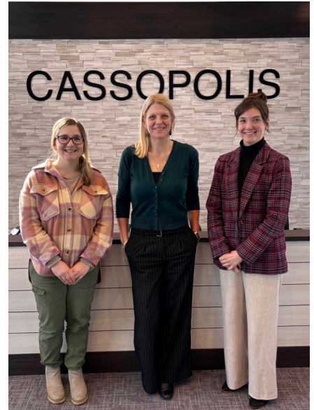
Village of Cassopolis