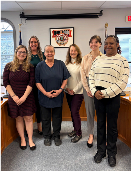
City of Hartford