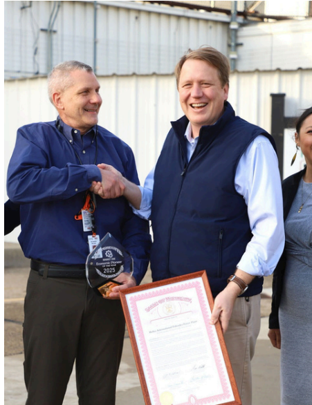
Holtec Palisades Power Plant | Covert