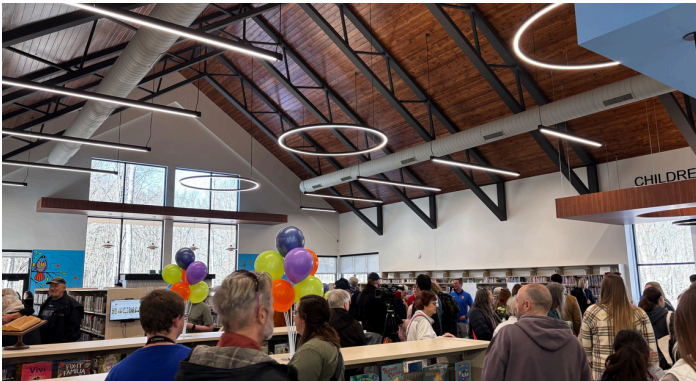
Grand Opening of Edwardsburg Library