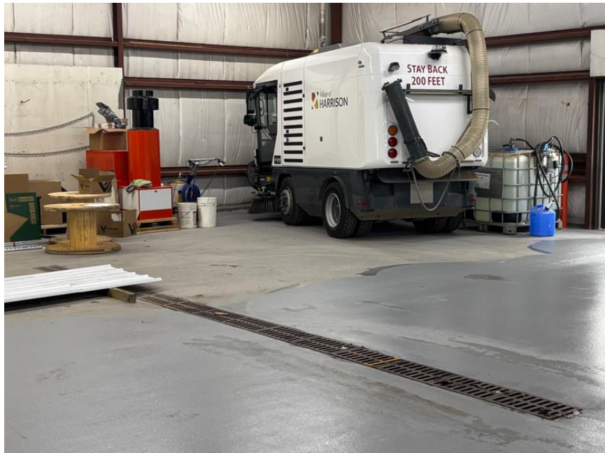
Dirty vs. Clean floor from floor scrubber