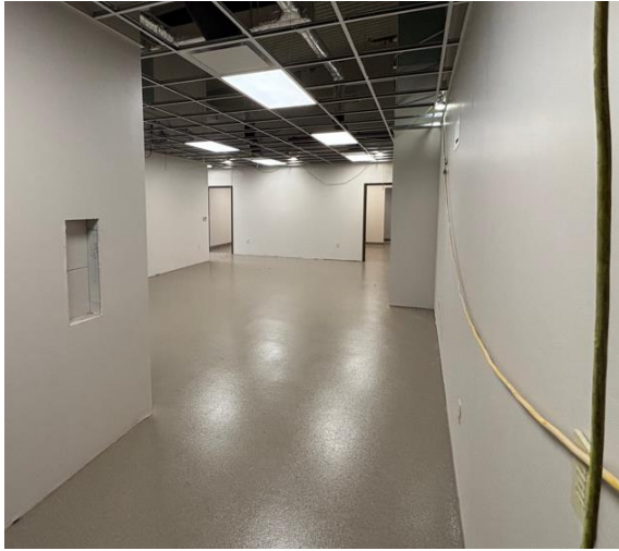
New DPW breakroom