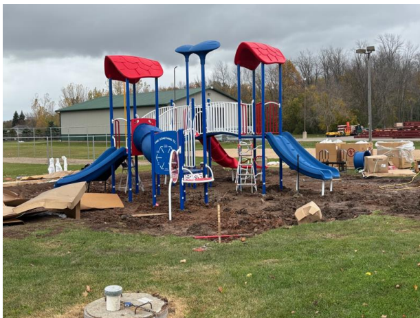
New Playground Install at HAA