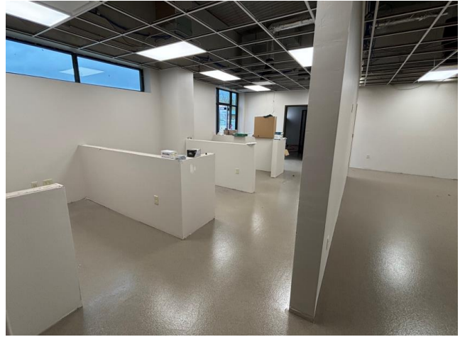
New DPW supervisor workstations