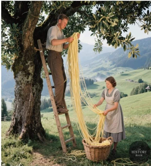
BBC news once convinced thousands of viewers spaghetti grew on trees. A 1957 April Fools' prank showed farmers harvesting pasta. When viewers asked how to grow their own, the BBC told them to plant a sprig in tomato sauce.

On March 24 and 25 about 150 third graders, teachers and chaperones from Navigator School came to the museum in groups, each lasting an hour and a half. During that time, they visited a 19 th century schoolroom, made butter, made an old-fashioned decorative craft and toured the gallery.