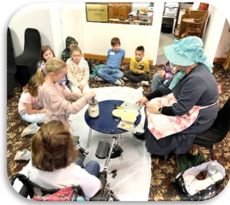
Making home churned butter and having a taste!