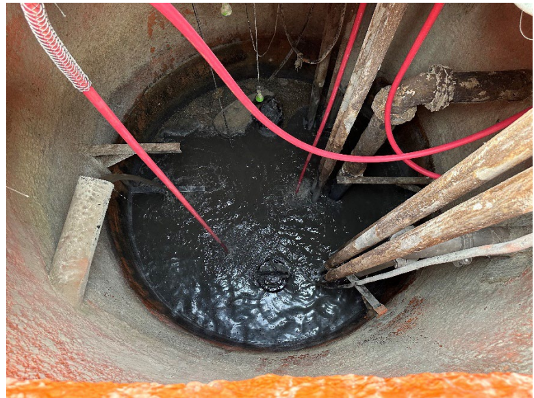
After 4 days