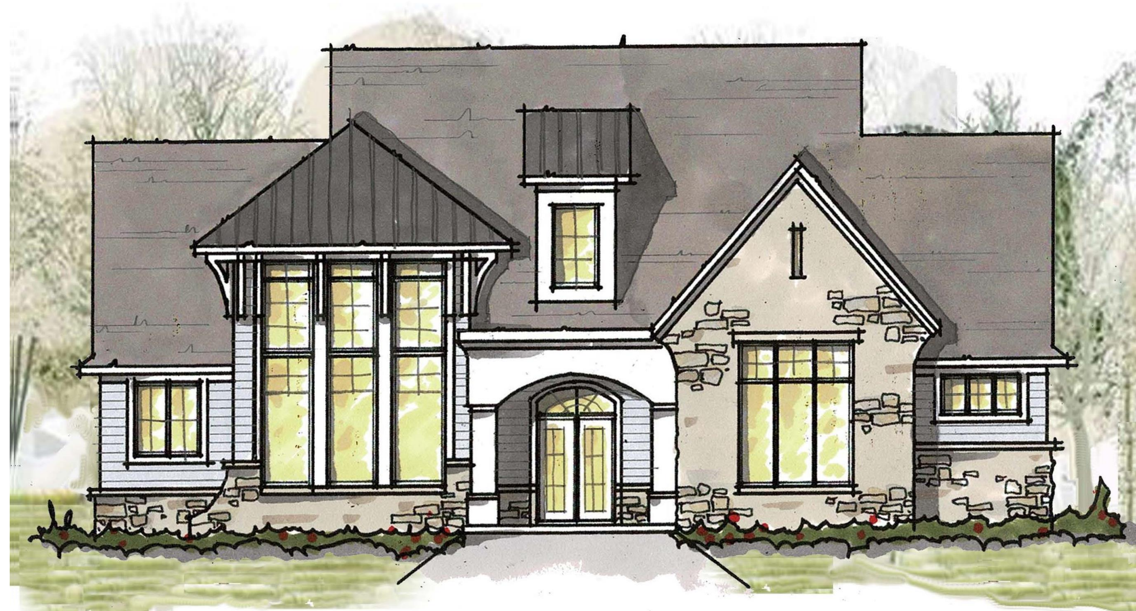
PROPOSED CLUB HOUSE