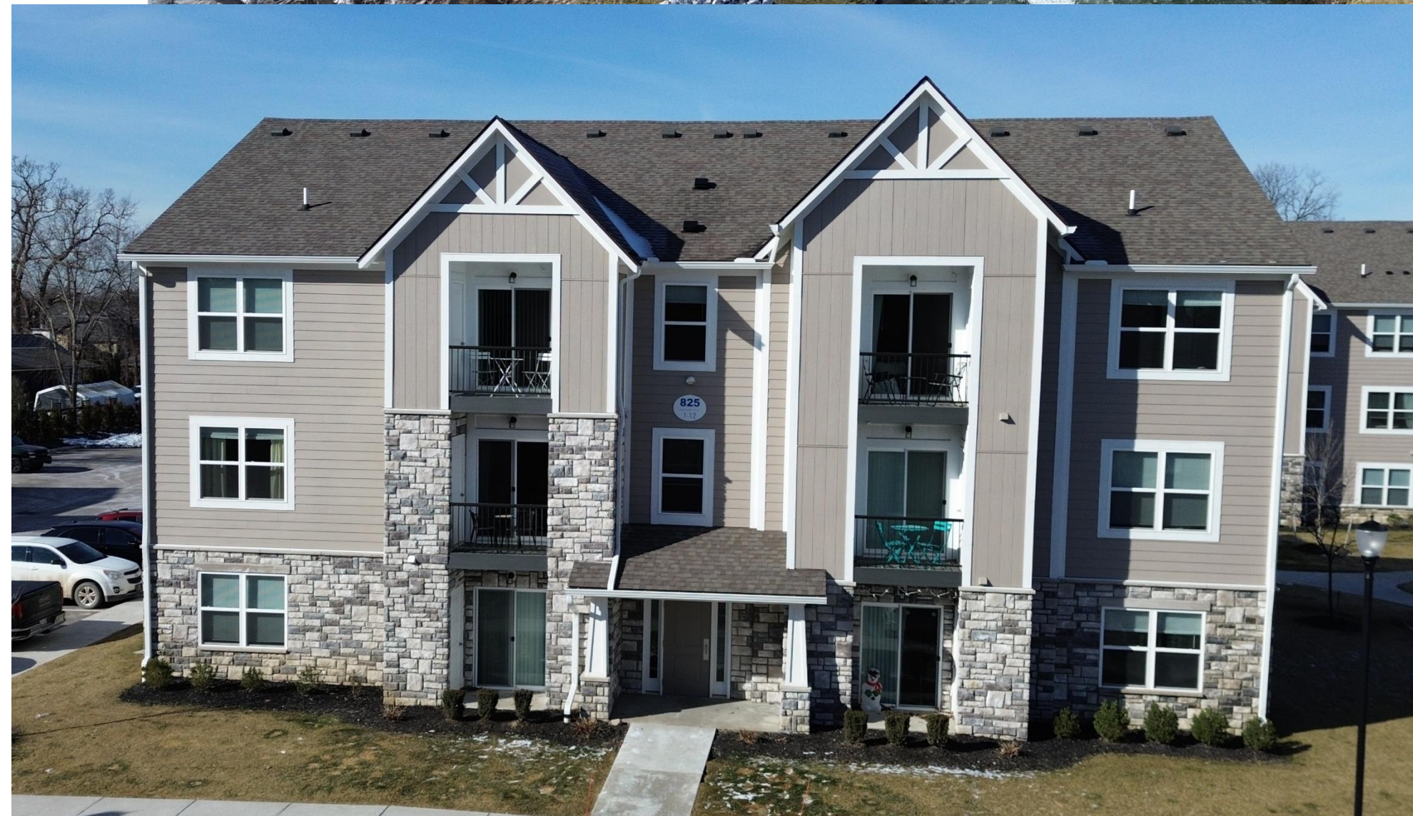
WESTLAKE PLACE APARTMENTS South Lyon, MI 72 Units Completed 2022