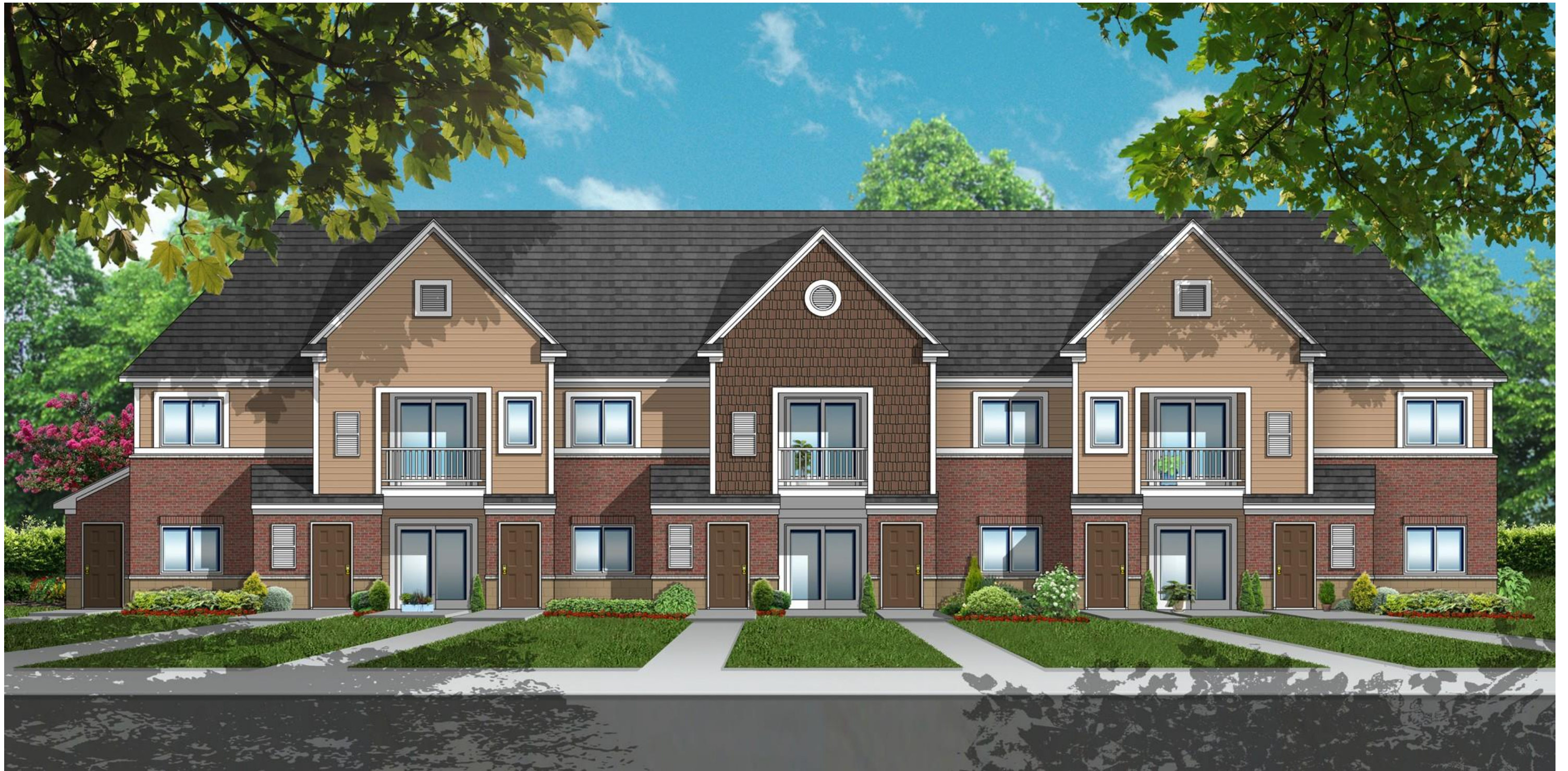
PREVIOUSLY APPROVED EXTERIOR ELEVATION (2022) The Crossing at Lakelands Trail