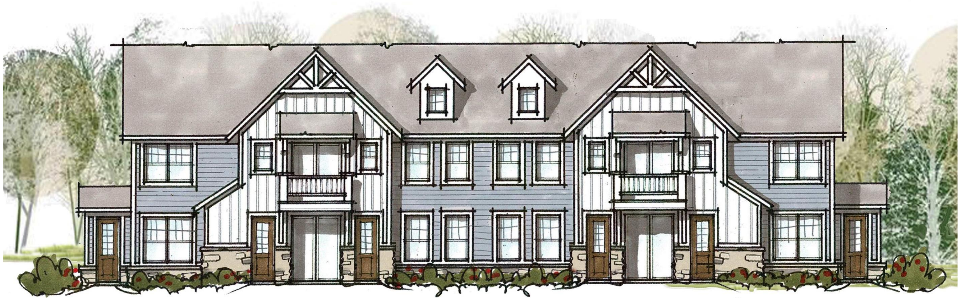
PROPOSED EXTERIOR ELEVATION (TOWN HOME UNITS) The Crossing at Lakelands Trail