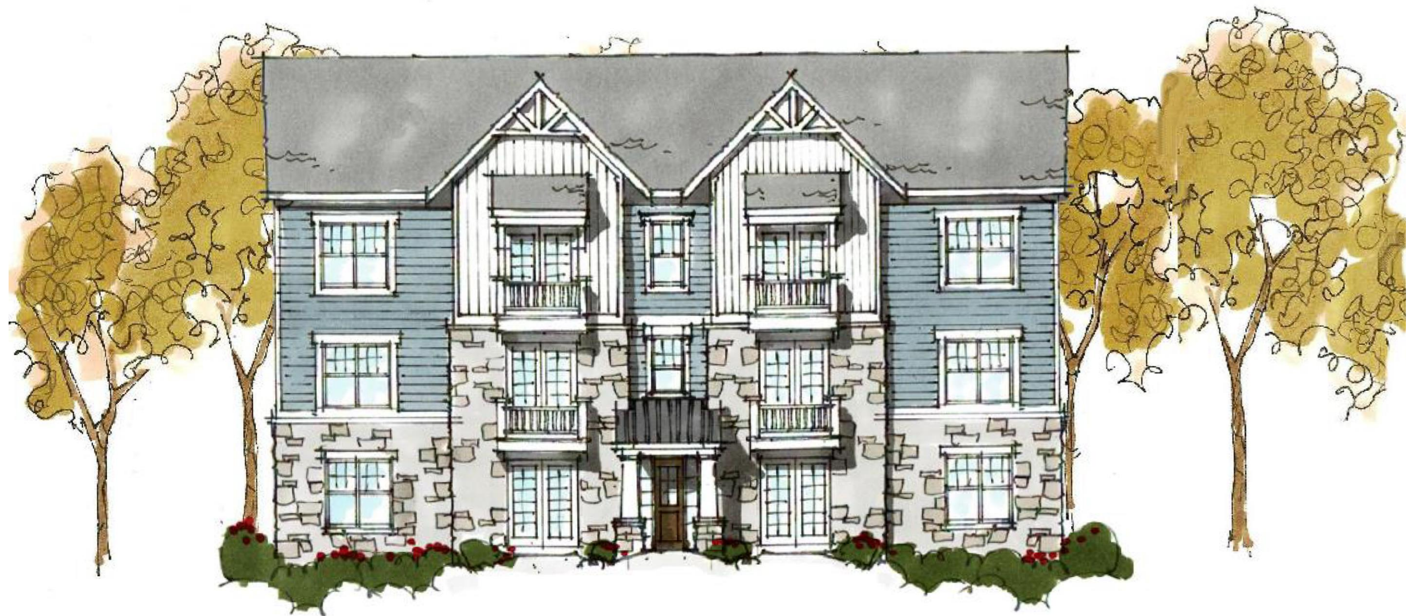
PROPOSED EXTERIOR ELEVATION (3-STORY UNITS) The Crossing at Lakelands Trail