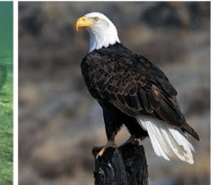
Bald Eagle Haliaeetus leucocephalus