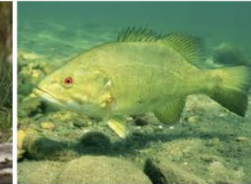
Smallmouth Bass Micropterus dolomieu