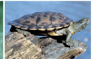
Northern Map Turtle Graptemys geographica