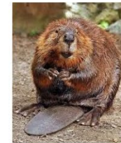
American Beaver Castor canadensis