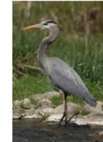
Great Blue Heron Ardea herodias