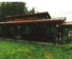
Covered Entry and Eating Area