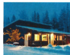
Favorite Gustavus Hangout