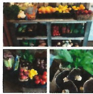
Produce For Sale