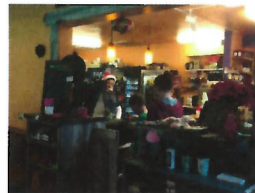
Interior Market & Sandwich Shop