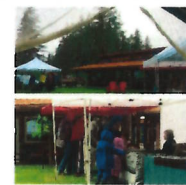
Weekend Public Market