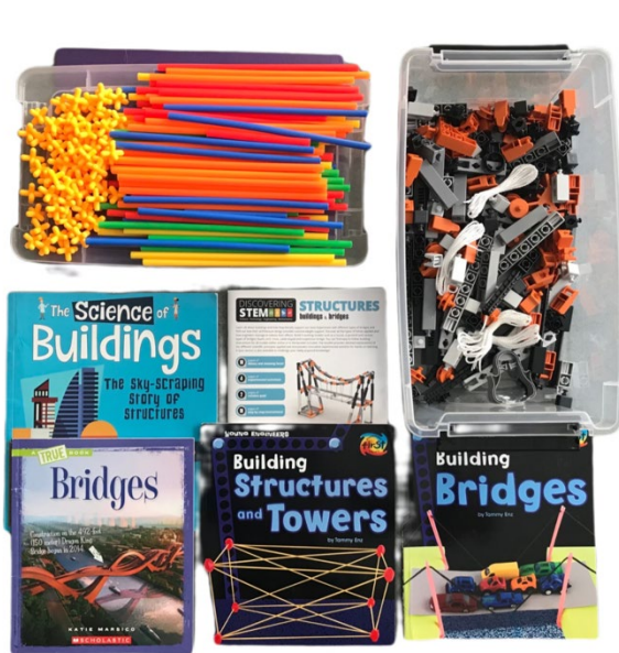
Building Bridges and Buildings STEM Kit