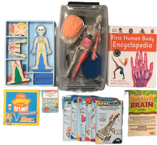
Human Anatomy STEM Kit