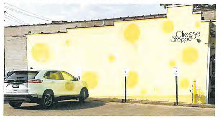
Rendering of the proposed renovated façade.