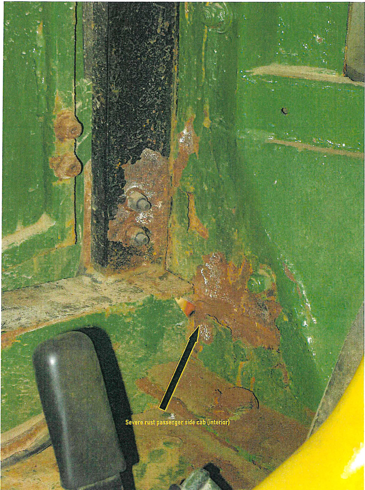
Severe rust passenger side cab (interior)