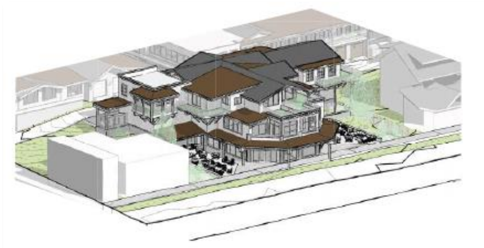
Excerpt of Lake Avenue Rendering from the Preliminary Development Plan (attached)