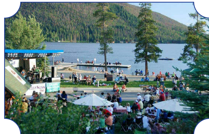
Grand Lake Festival 14

Likewise, Grand Lake’s economy is largely seasonal, yet includes many other unique attractions besides RMNP: hiking, ATV and mountain biking trails on US Forest Service land; a historic, walkable downtown on the shore of Grand Lake; rowing, paddling, boating and fishing on Grand Lake and Shadow Mountain Reservoir; an annual Regatta Week hosted by the Grand Lake Yacht Club; the long-standing Buffalo Days Weekend festival and other local cultural events, notably performances by the Rocky Mountain Repertory Theatre.