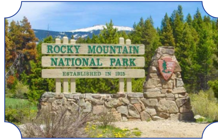
Western RMNP Entrance 13

Since the turn of the twentieth century, Grand Lake’s economy has been strongly linked to tourism and outdoor recreation. Grand Lake’s location as the western gateway to Rocky Mountain National Park is a significant economic asset for the community. Over 4.5 million tourists visited Rocky Mountain National Park (RMNP) in 2018, although the majority of park visitors travel through RMNP’s eastern gateway, Estes Park, and do not make the journey to Grand Lake. In addition, the vast majority of trips to RMNP are between June and September.