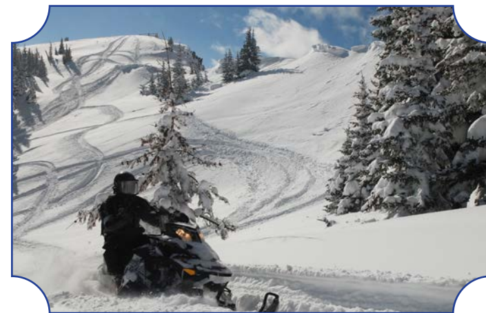
Snowmobiling in Grand Lake area 15

Mid-October through Memorial Day is Grand Lake’s “secondary season.” Those visitors that make the journey and access RMNP trails from the edge of town are treated to a winter wonderland. The Grand Lake Golf Course becomes the Grand Lake Nordic Center, available for cross-country skiing and snowshoeing. Two downhill ski resorts (Winter Park/Mary Jane and Granby Ranch) are within one hour drive of Grand Lake. And with access to hundreds of miles of snowmobile trails, Grand Lake is known as the “Snowmobile Capital of Colorado.”