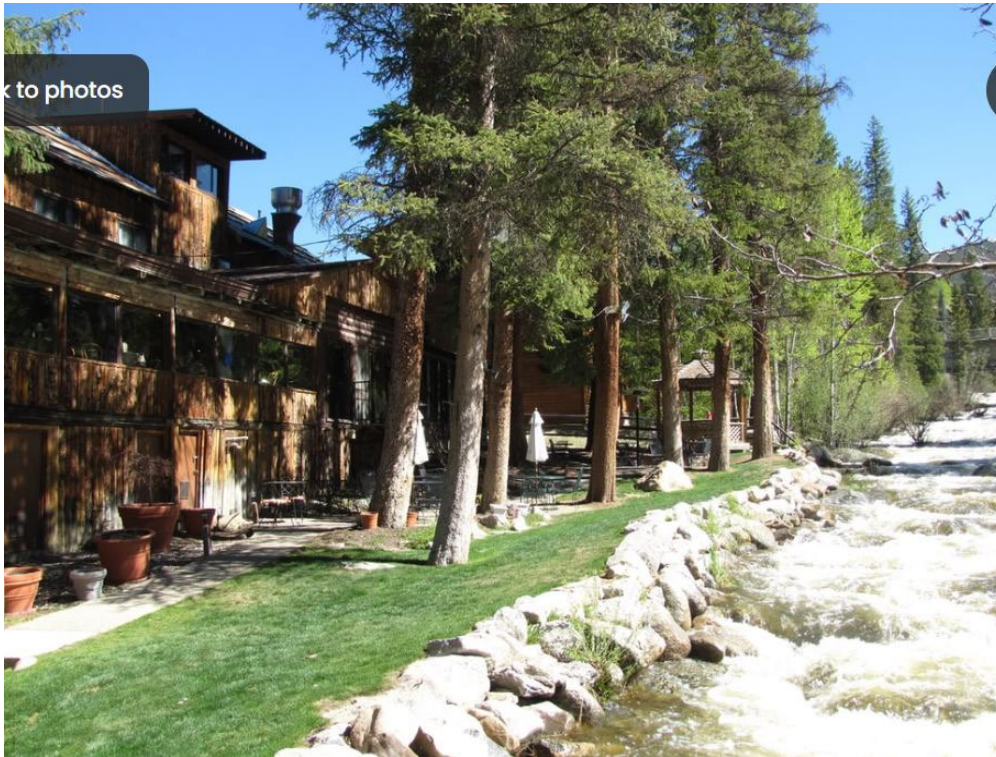
Figure 4-2014 thick lawn after the 2011 shoreline reinforcement

In photos obtained from online reviews, grass along the shore appears as a thick lawn in 2014 (fig 4), but by 2019 it is sparse (fig 5), and all but gone in 2021 (fig 6).