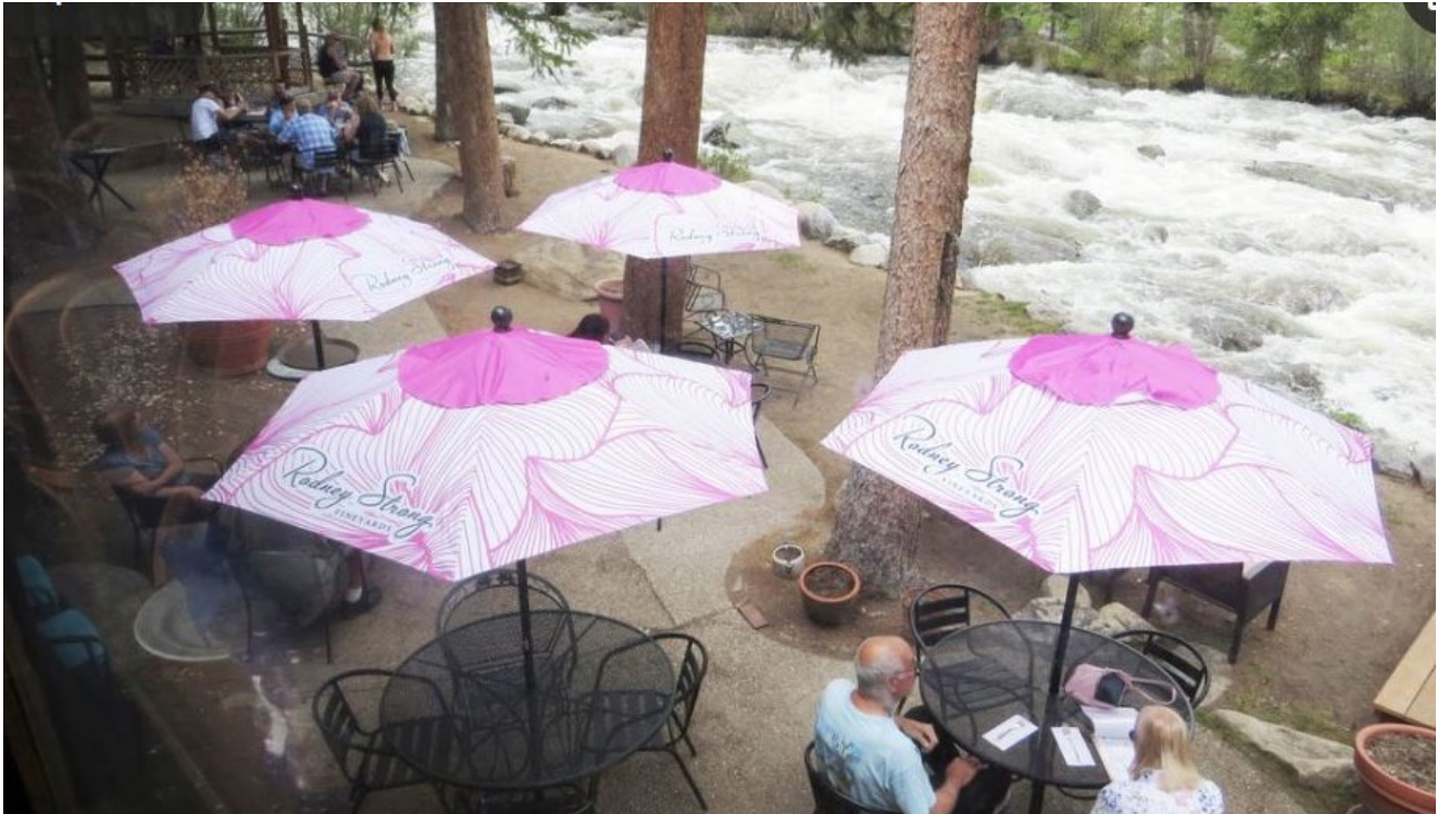
Figure 6- 2021 no deck no grass; very high water

By having dining on the shoreline without proper vegetation, erosion will continue to occur, and although none are showing yet, tree roots can be exposed, and compacted soil will increase, as captured in these images (fig 7).