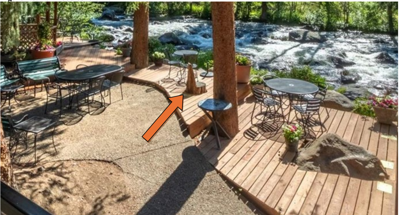
Figure 3- Recent photo showing tree stump cut into a chair shape, for reference.