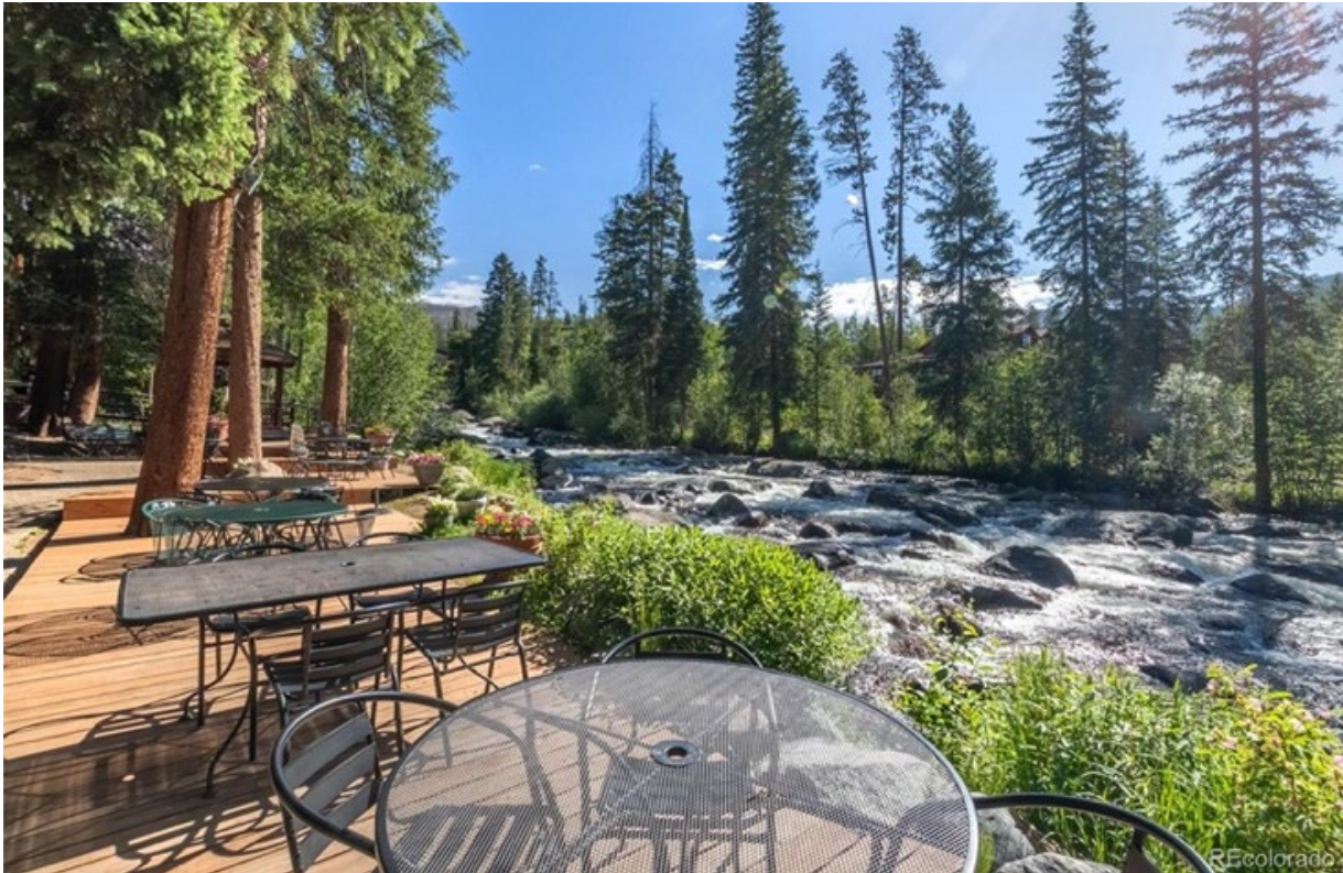
Figure 10 - shoreline vegetation -images from 2023 online real estate marketing