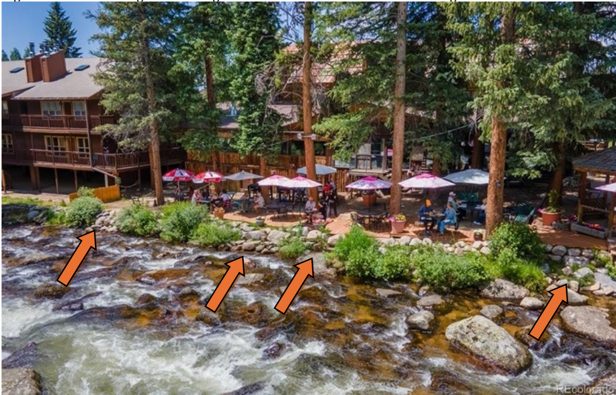
Figure 11- shoreline vegetation (orange arrows at areas with sparse vegetation proposed to be maintained)