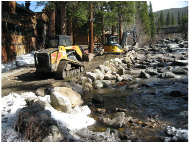
Figure 2 & 2b- Flood control 2011