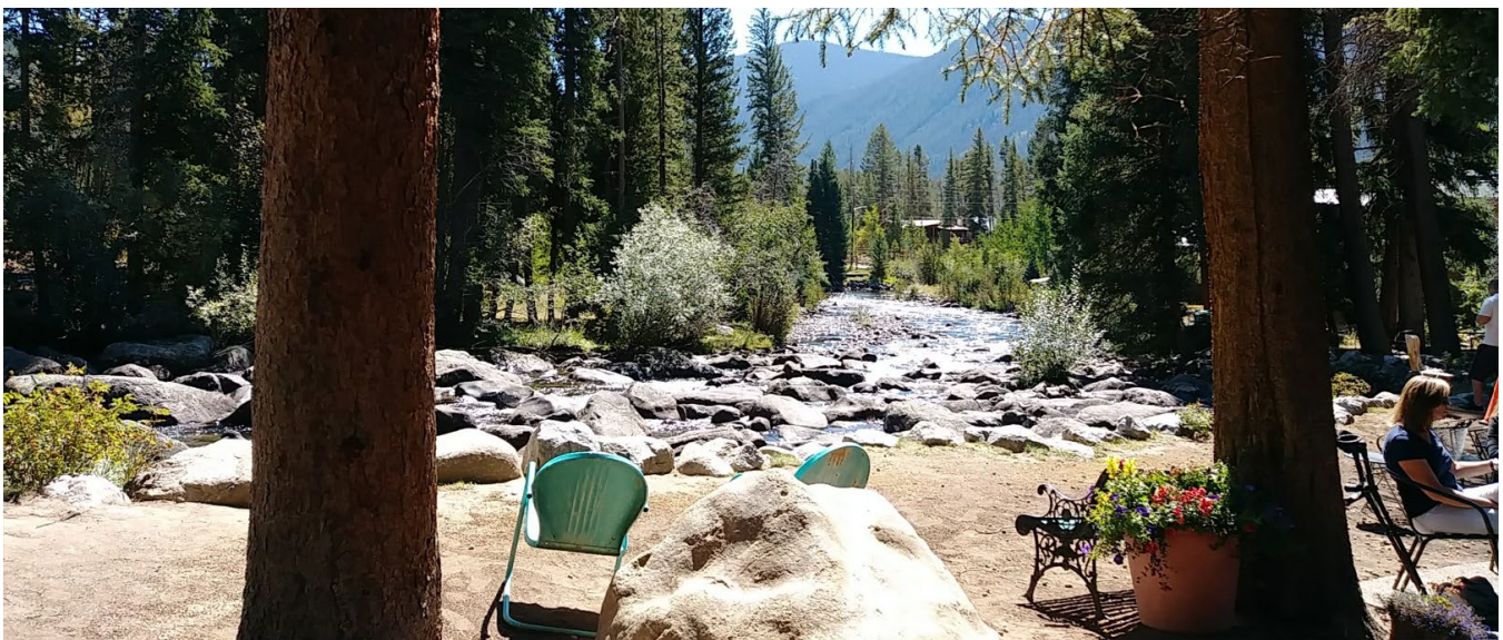
Figure 7- 2020 no grass, compacted soil, no roots shown

By having dining on the shoreline without proper vegetation, erosion will continue to occur, and although none are showing yet, tree roots can be exposed, and compacted soil will increase, as captured in these images (fig 7).