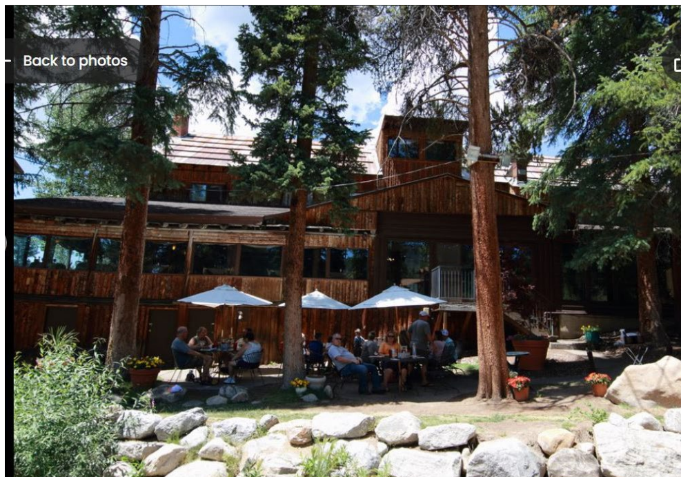
Figure 5- 2019 sparse lawn