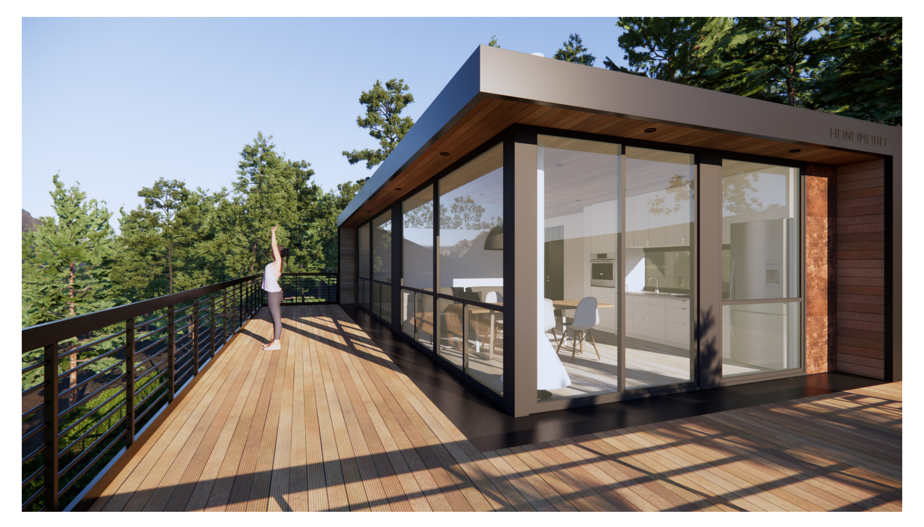
Deck and Patio Door