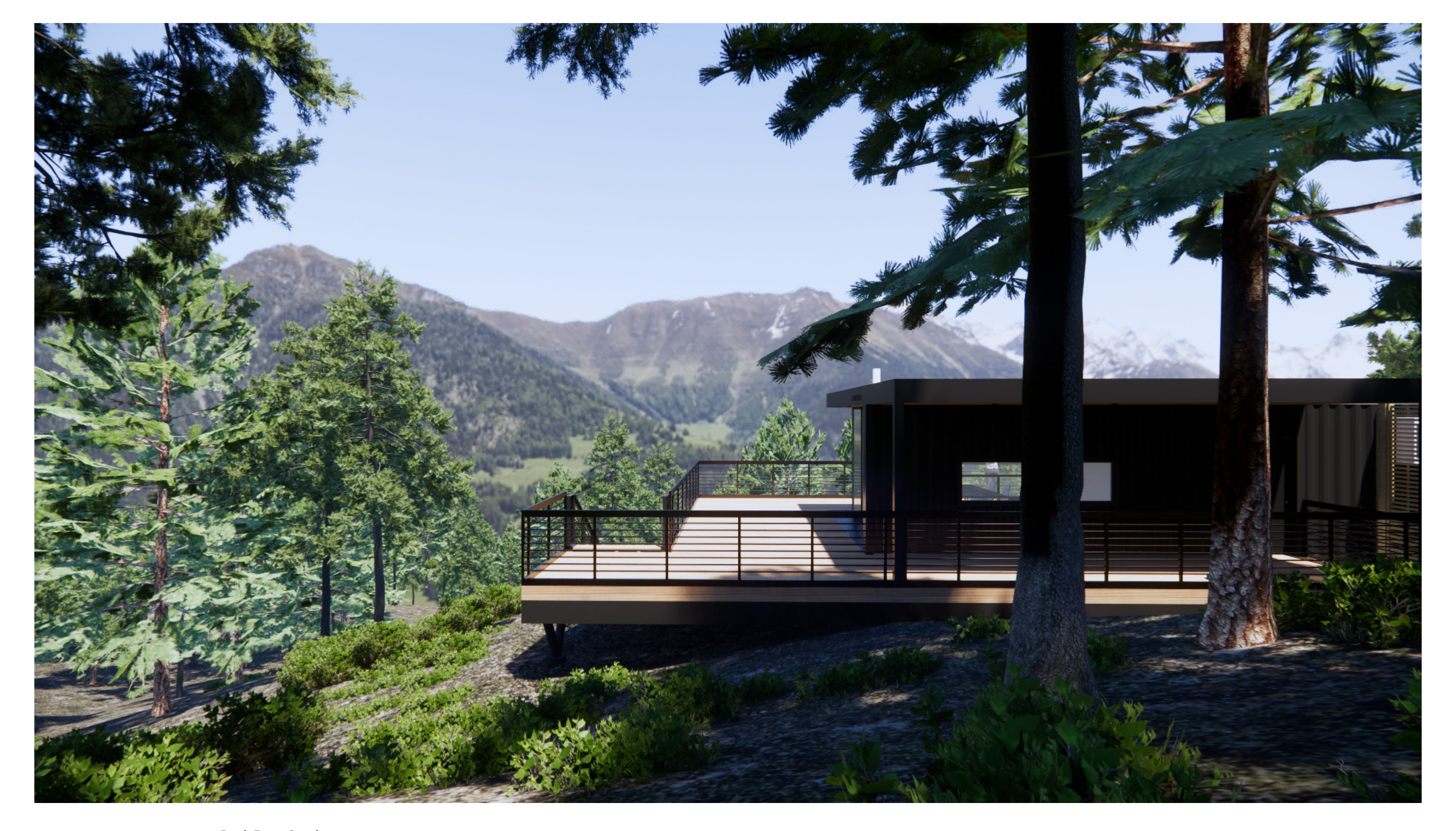
Deck From Southwest