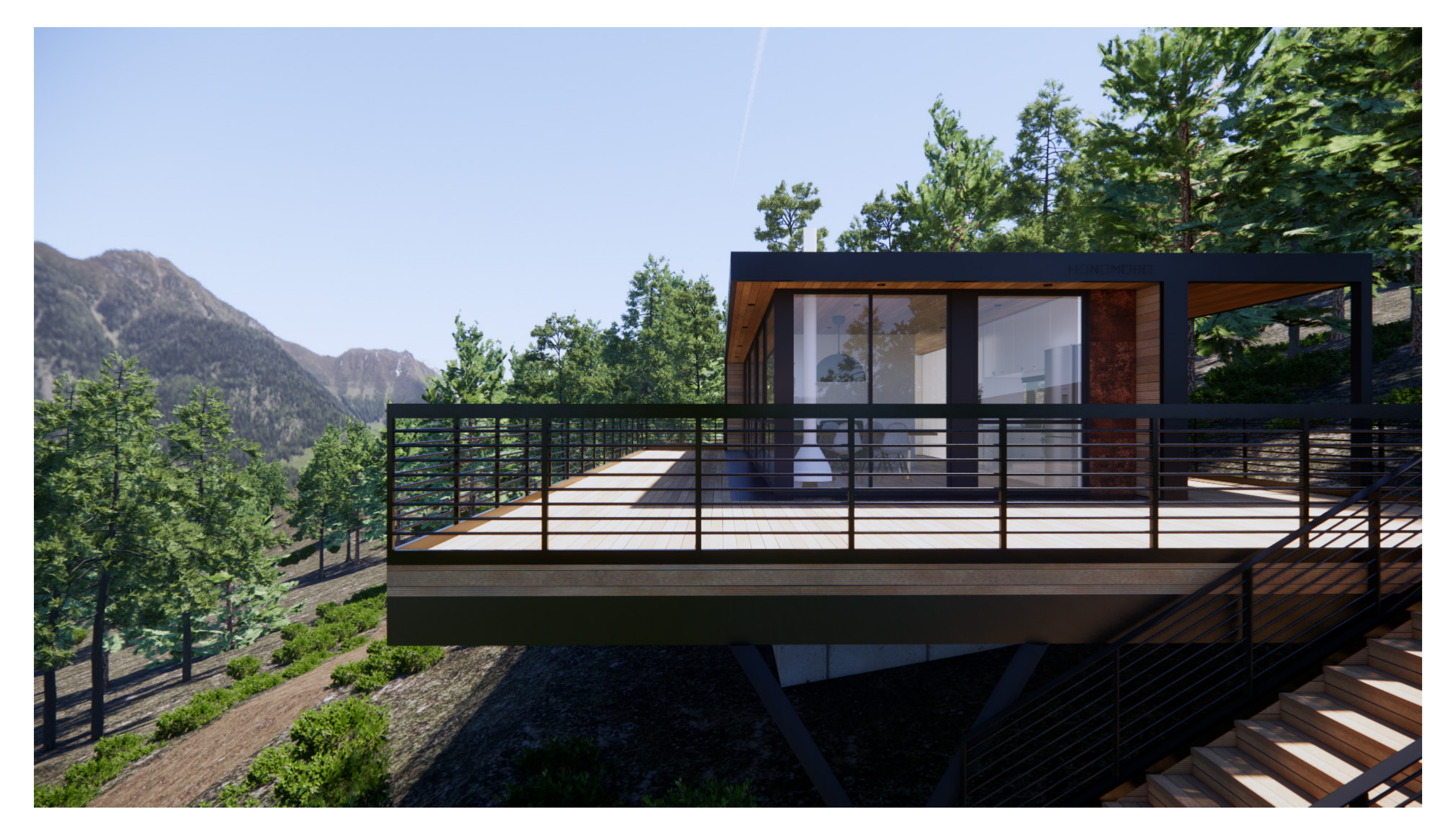
Deck and Stairs