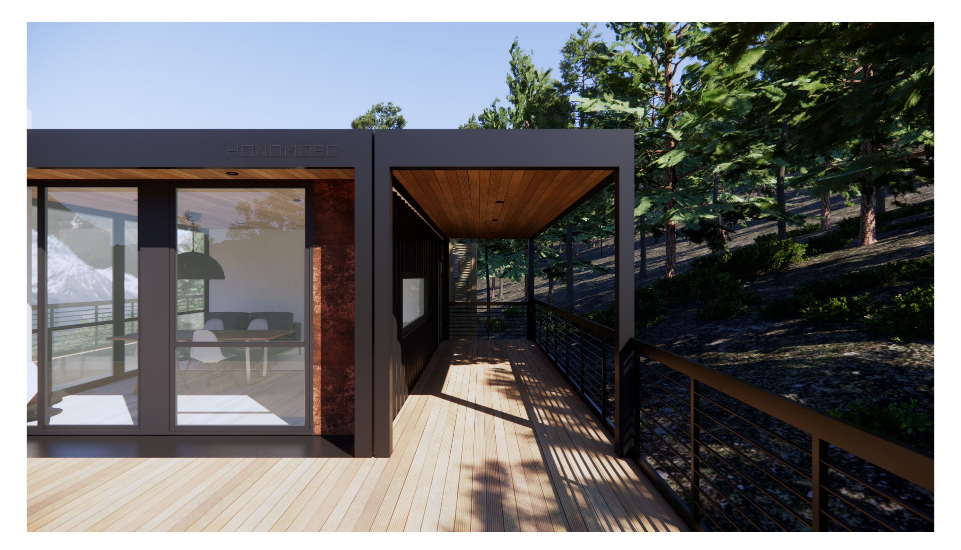
Entry Deck and Pergola