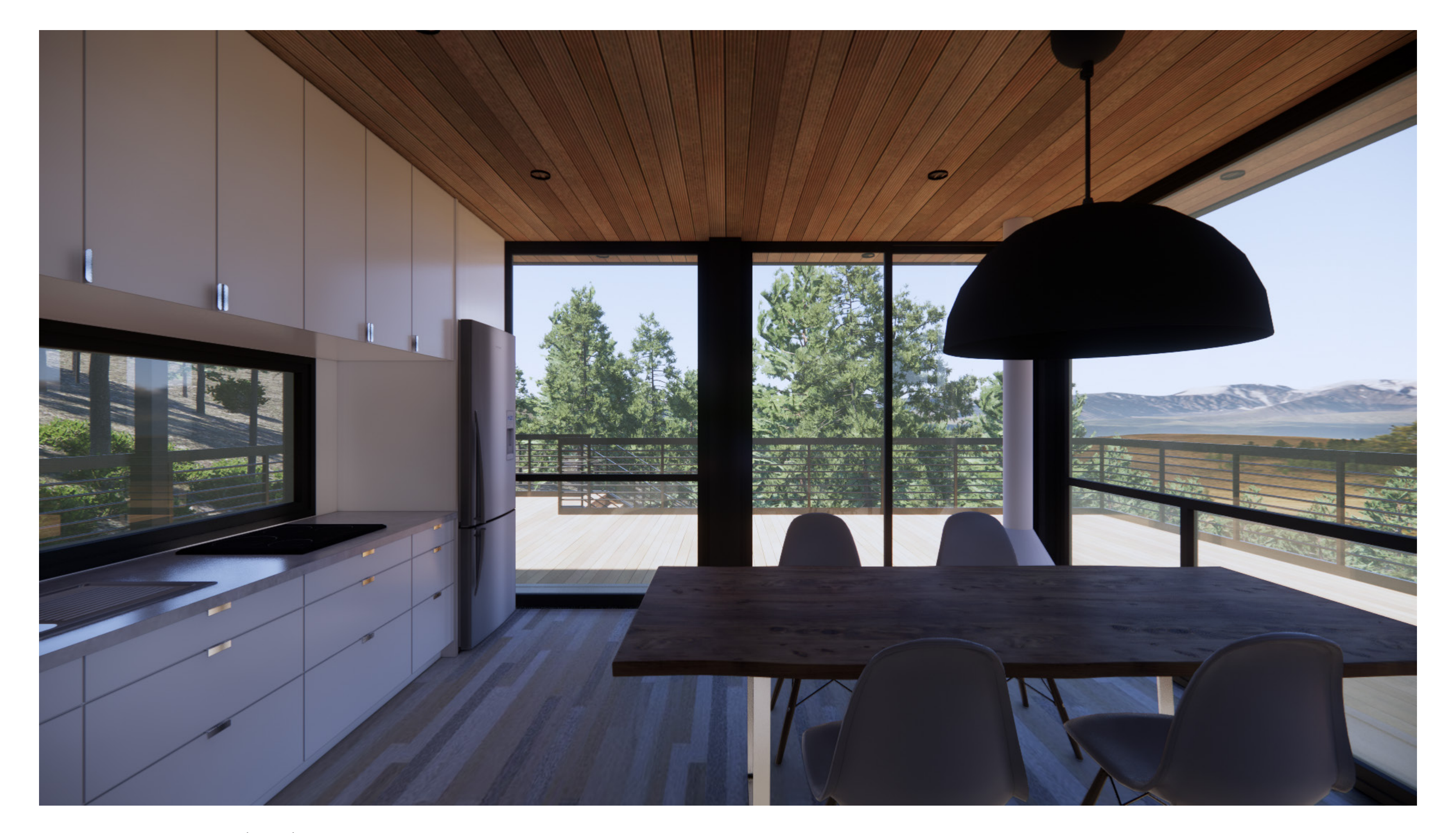
Kitchen and Living Room