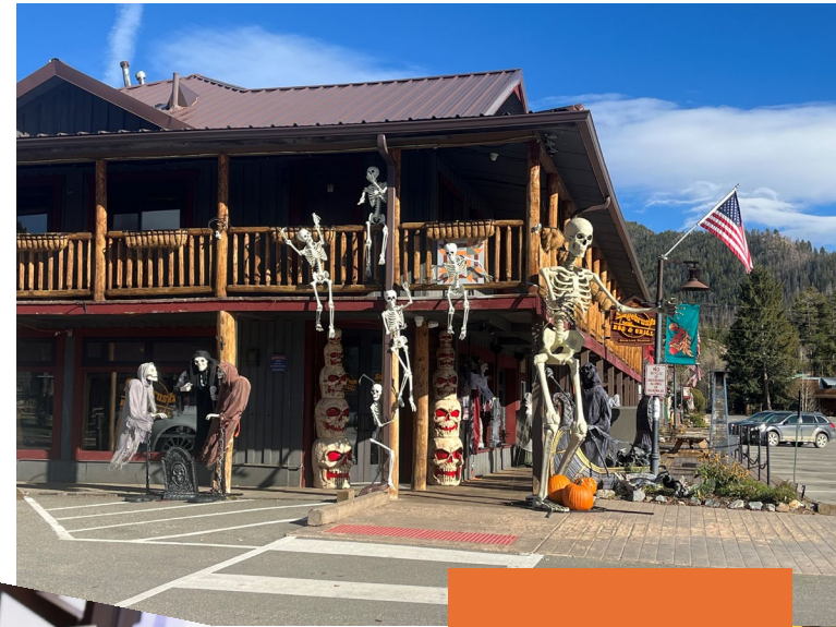
Winners of Decoration Contest Sagebrush BBQ