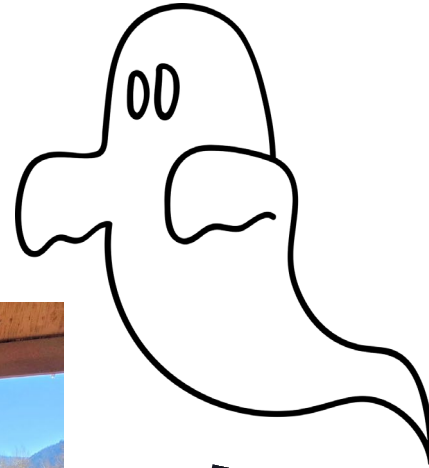
Winners of Costume Contest