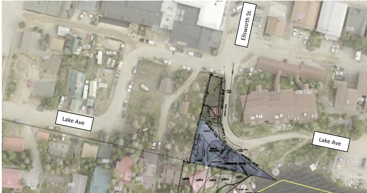
Vacation plat overlaid onto Town map