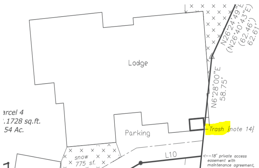
Proposed Trash Location within Property Line