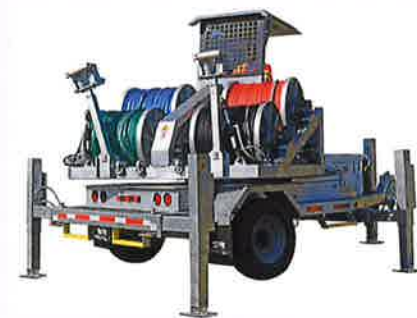
Ergonomic operator's station