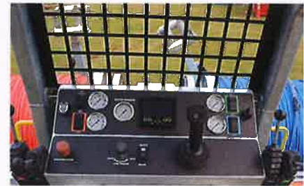
Ergonomic operator's station