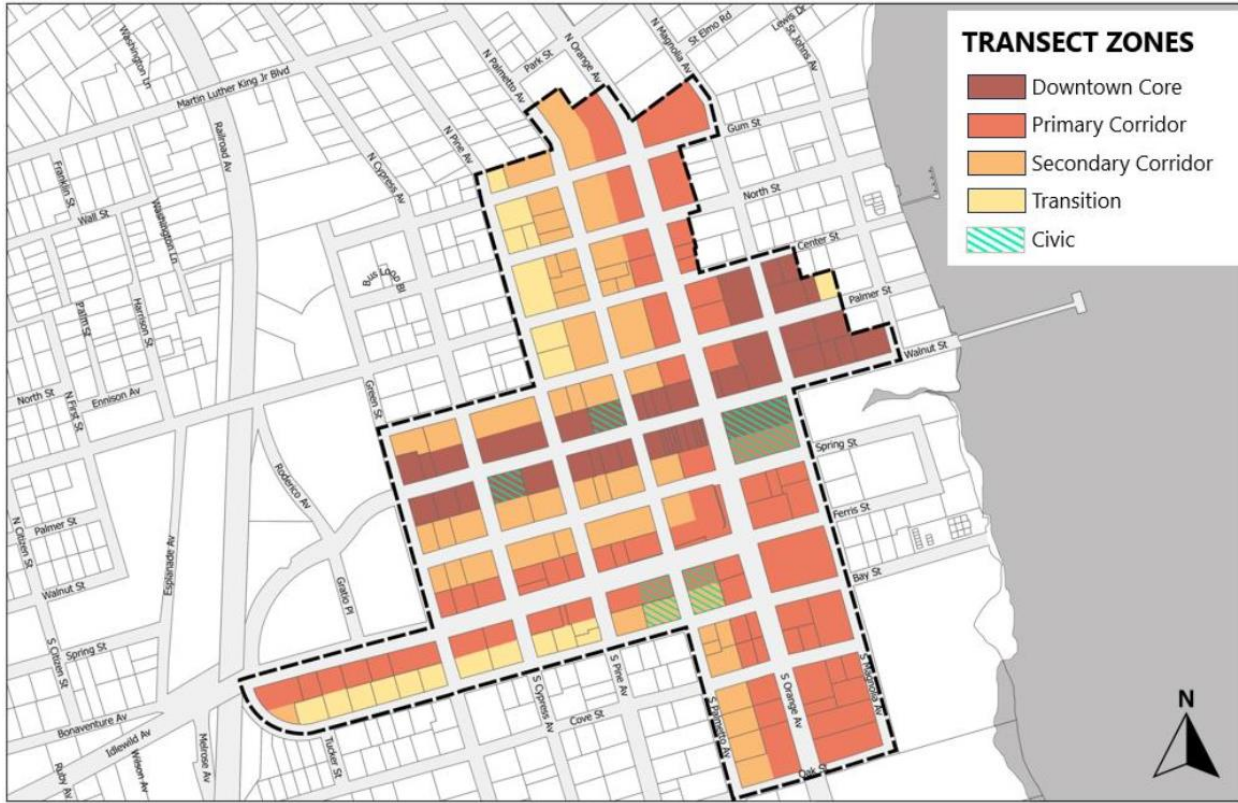
Exhibit C - Parcels Proposed to be Rezoned for Form-Based Code Zoning District