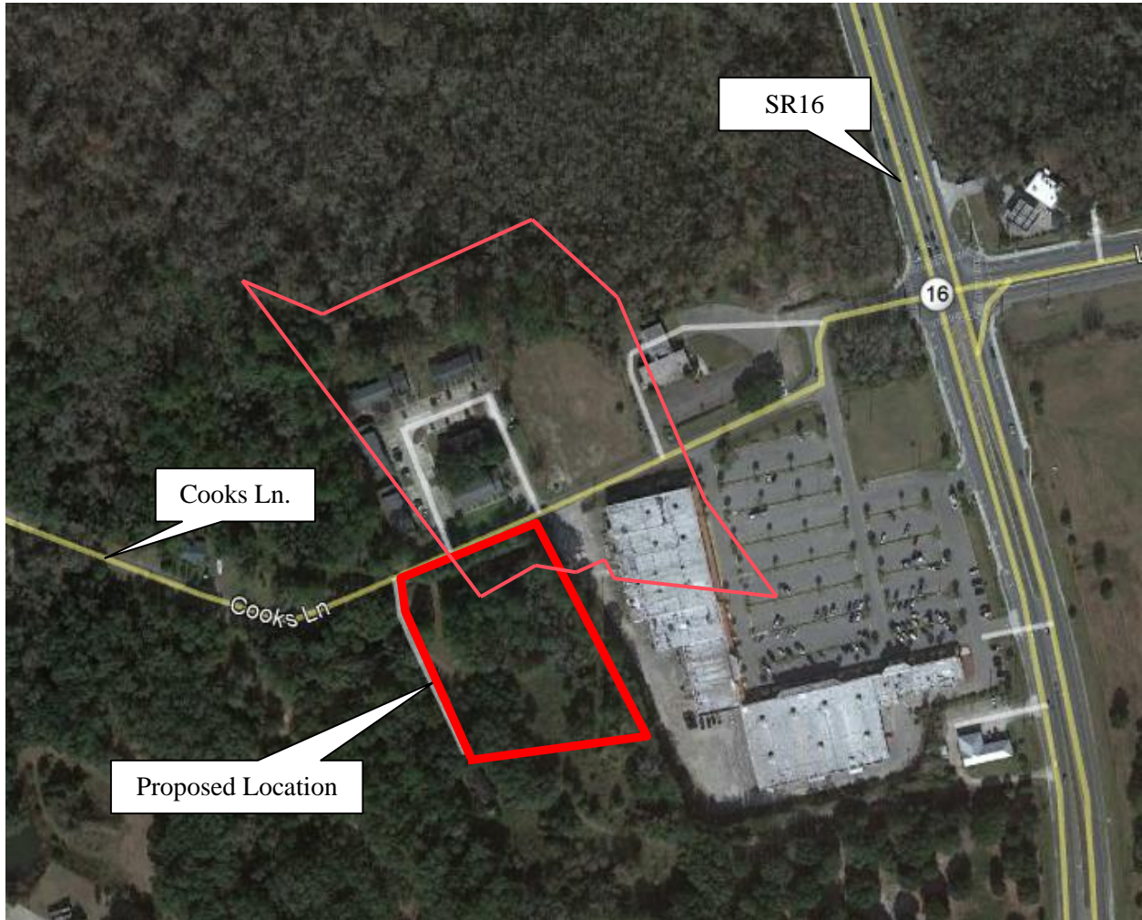
Aerial Photo from Clay County Property Appraiser office.