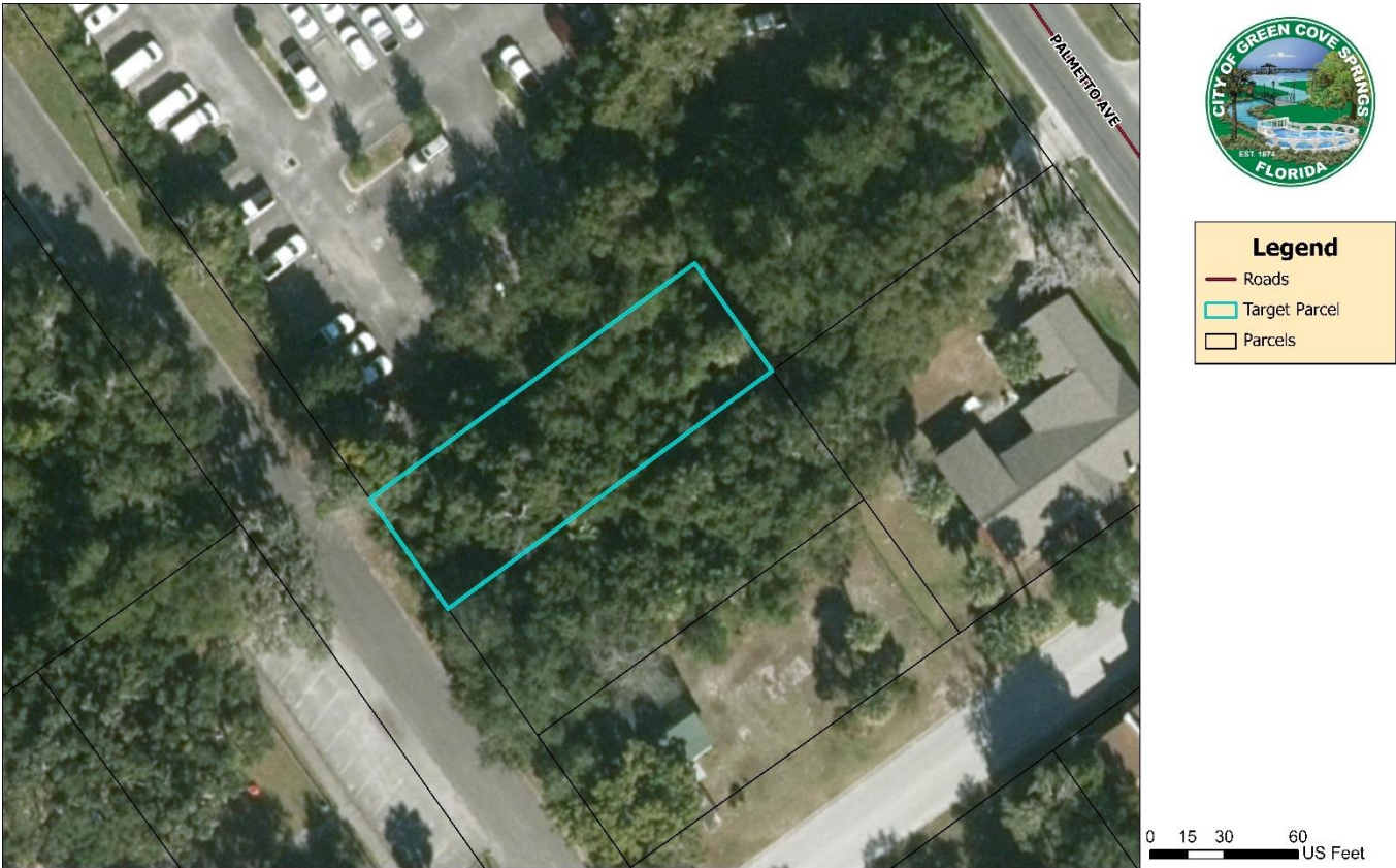
Figure 1. Aerial Map

The site is located within the City’s Water, Sewer, and Electric Service Boundaries. It will be served by the City’s utilities and sanitation services.