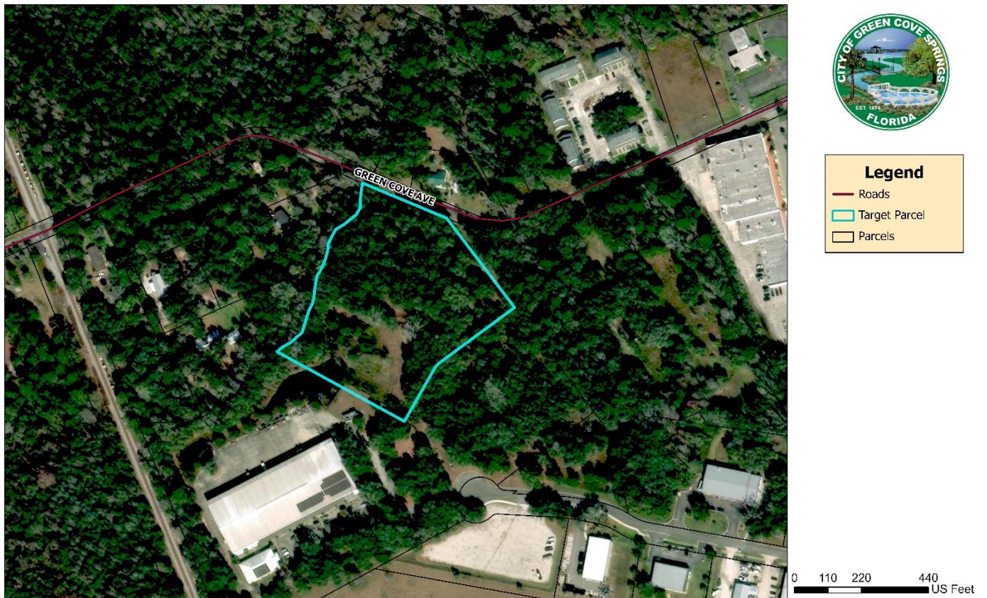
Figure 1. Aerial Map