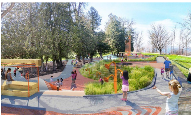
Oakledge Accessible Playground

The City shall ensure public access to recreation sites throughout Green Cove Springs.