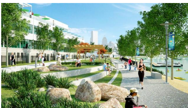
3 Crossings Concept Plan, Pittsburgh (Credit: WTW Architecture)

Policy 6.2.1. The City shall provide ADA-compliant parking and barrier-free access for the elderly and disabled population to all municipally owned recreation facilities.