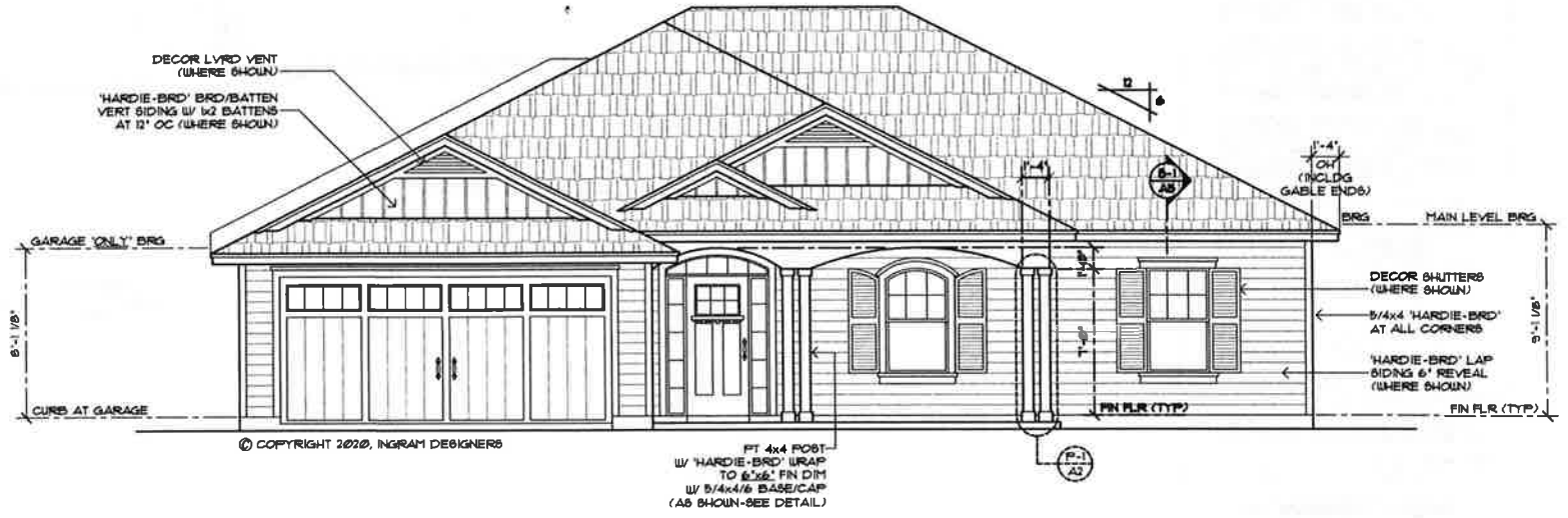
front elevation SCALE 1/4"=1'-0"