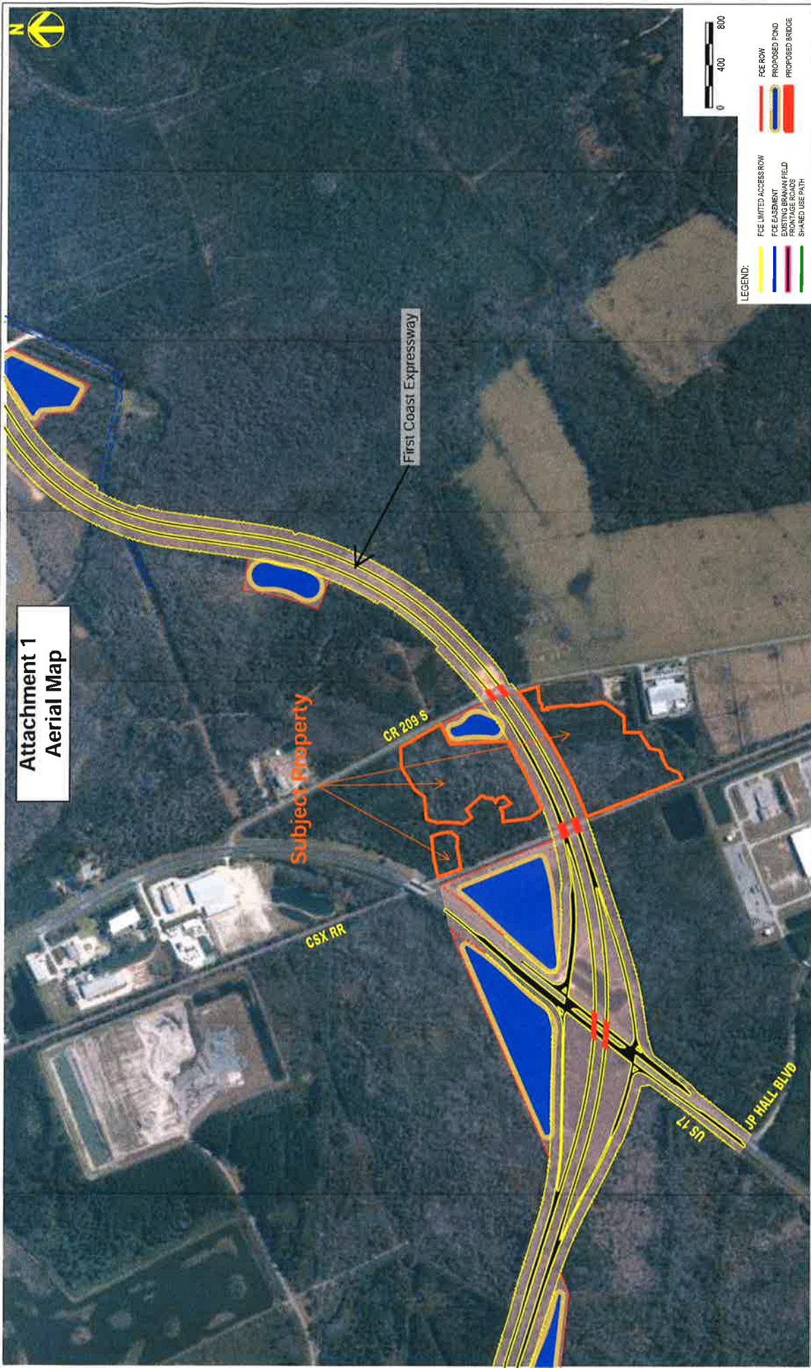
Attachment 1 Aerial Map