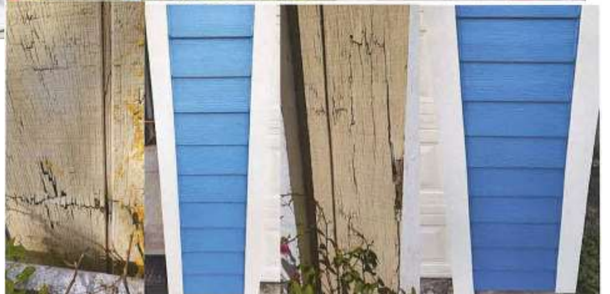
529 Perry Avenue