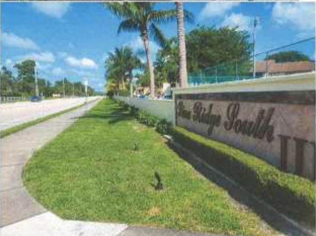
Pine Ridge South III Melaleuca Lane