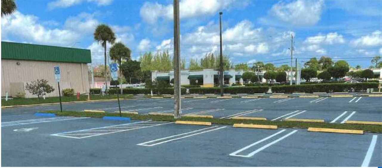
Greenacres Bowl 6126 lake Worth Road