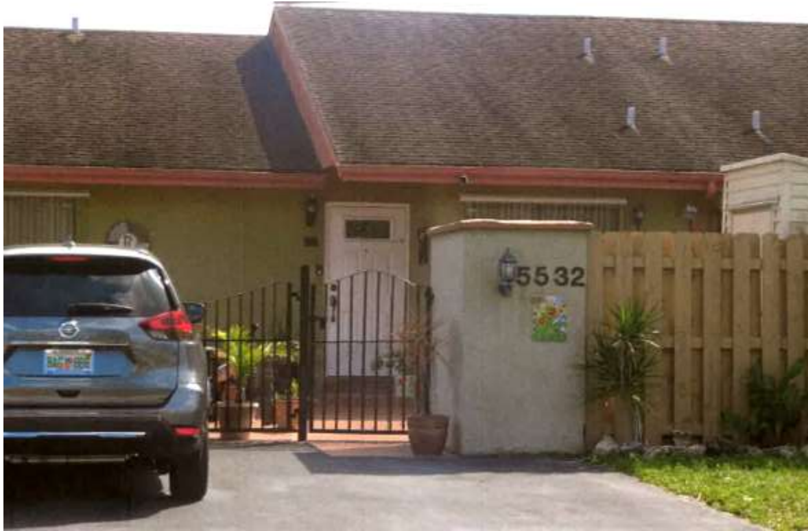
5532 Biscayne Drive