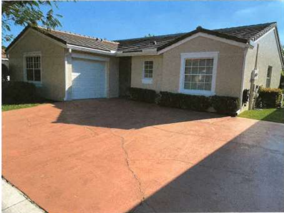
157 Caribe Court