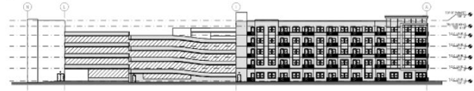
4 COOL EXTERIOR ELEVATION AT ALLEY DATE: 08/11/17