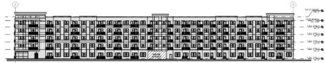
2 COOL EXTERIOR ELEVATION AT 11TH ST. DATE: 08/11/17